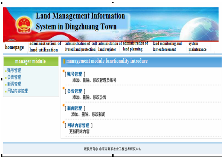
Fig. 5. System maintenance module interface