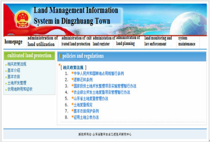
Fig. 3. Farmland protection interface