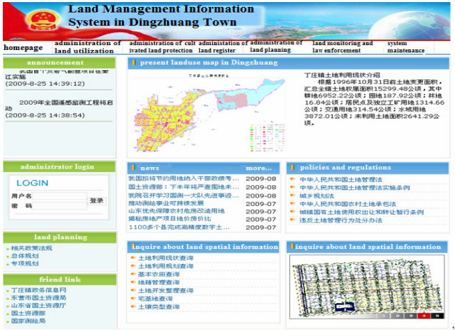
Fig. 2. Host interface of the system

This spatial information inquiry function contains four modules: layer demonstration; Hawkeye; attribute inquiry; inquiry outcome demonstration. In addition, there are other human-friendly functions like enlargement, shrinking, measurement, whole layer demonstration and so on. The first feature is that the users can inquire all kinds of land data information by clicking graphs, such as land plot basic information, land conversion information, basic geographic information and so on. The second feature is that users can inquire spatial graphic information by inputting conditions and also make inquiries by selecting land categories, the administration it belongs to and administrative region.