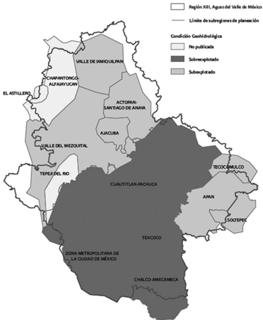
Fig. 22.2 Shows the geohydrological condition of aquifers, overexploited and underexploited