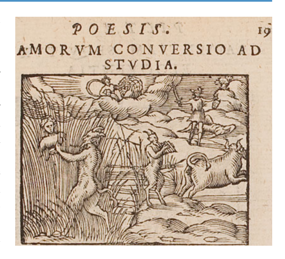
Fig. 22.1 Pan and Syrinx, Bernard Salomon, 1552 (Herzog August Bibliothek Wolfenbüttel)

The third scene, portrayed just to the right of the second, shifts the illustration into obliquely related realms. It shows a heifer springing out of the picture. This is an allusion to the story of Io, a priestess of Argos who was transformed into a heifer by Zeus, in order to hide his adulterous designs from his wife Hera. When the heifer was