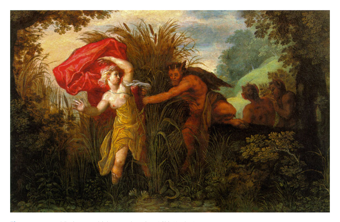
Fig. 22.3 Pan and Syrinx, Hendrick van Balen, circa 1600