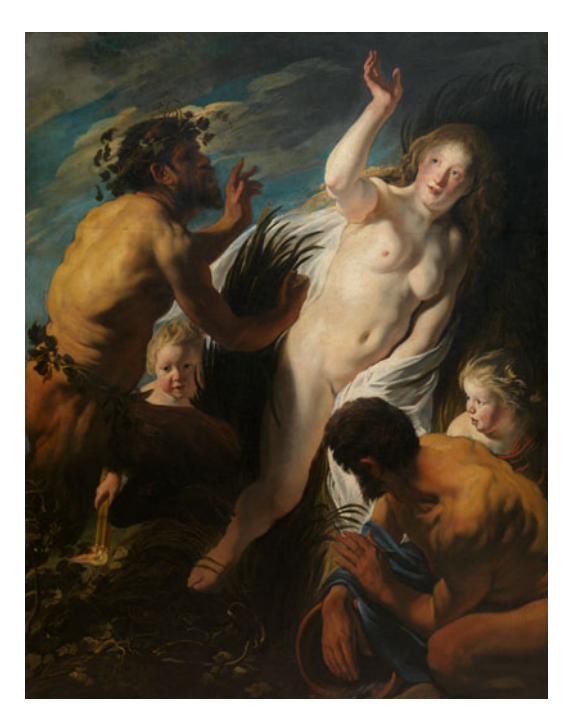
Fig. 22.7 Pan and Syrinx, Jacob Jordaens, 1618–1619.

Jordaens also took part in this rivalry with Rubens and Janssen. The technical art-historical term for when a painter sets out to awaken greater interest in the viewer, by intensifying and emphasising certain visual details, already present in earlier paintings on the same theme, is "amplificatio". Thus, the first thing that strikes the viewer about Jordaens's painting of 1618–1619 is that it is an "amplification" of earlier treatments, in the most literal sense of this term. The size of the canvas is now increased to 176×136 cm (Fig. 22.7). Janssen's outdoing of Rubens's 40\times61 cm canvas with a canvas of 120\times98 cm is thus here itself outdone, with a canvas of such a scale that the figures in Jordaens's picture attain life-size dimensions. Furthermore. Jordaens arranges the principal subjects quite dif-