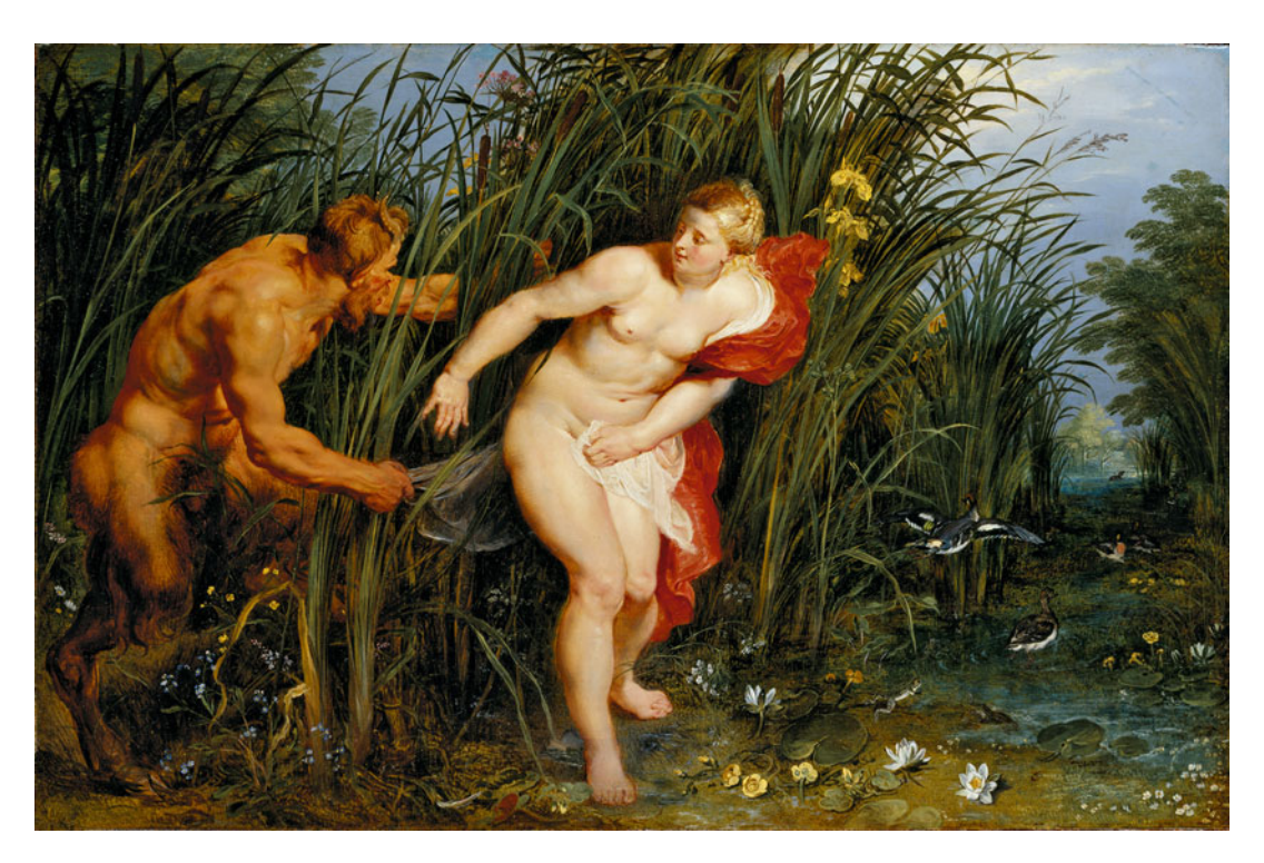
Fig. 22.5 Pan and Syrinx, Peter Paul Rubens and Jan Brueghel the Elder 1617 (Museumslandschaft Hessen Kassel, Gemäldegalerie Alte Meister, Germany)

The portrayal of the Syrinx motif in Western art reaches an acme in the paintings of Rubens, with one work in particular epitomising European painters' engagement with the "Pan and Syrinx" theme (Fig. 22.5). This painting is often referred to as the "Kassel picture", after the previous owner Landgrave Wilhelm VIII of Hessen-Kassel, founder of the Kassel Old Masters Gallery. The picture is what is referred to as a "cabinet painting" – only 40×60 cm in size but hugely impressive in its brushwork. It captures Pan in the moment when he believes that he is just about to get a firm grip on Syrinx. He is lunging forward on his strong goat's legs, his muscular body tensed for action. Although Rubens has positioned him in such a way that his head is seen