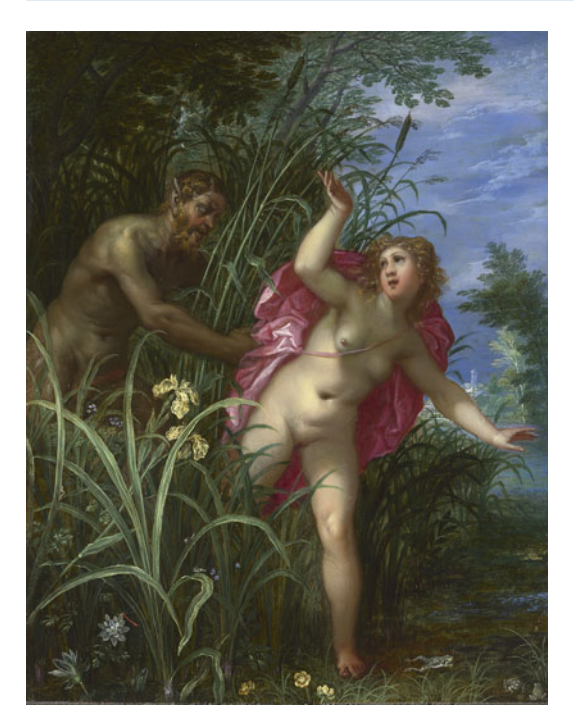
Fig. 22.4 Pan and Syrinx, Hendrick van Balen, 1615 (National Gallery, London, England)

the blossoms of the yellow irises and a frog leaping into the water, frightened by the struggling bodies of Pan and Syrinx. These details are later reproduced in a painting produced jointly by Rubens and Brueghel the Elder in 1617, suggesting that these two artists may have also collaborated with van Balen (Fig. 22.5).