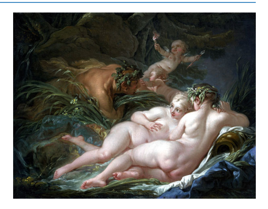
Fig. 22.8 Pan and Syrinx, Francois Boucher, 1759 (National Gallery, London, England)

Finally, representation of the erotic aspect of the episode culminates in the unambiguous image produced by an artist like Francois Boucher (1703–1770), court painter to King Louis XV (Fig. 22.8). This might be described as a fourth, content-related "amplificatio". In contrast, not all images of Syrinx depict Pan and his erotic intentions. The painting by the Victorian artist Arthur Hacker (1858–1919) instead links Syrinx solely and intimately with the reeds to which she gave her name (Fig. 22.9). Pan is only represented as her shadow.