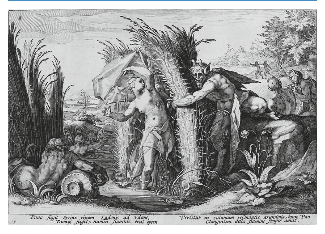
Fig. 22.2 Pan and Syrinx, Hendrick Goltzius, 1589 (Herzog August Bibliothek Wolfenbüttel)