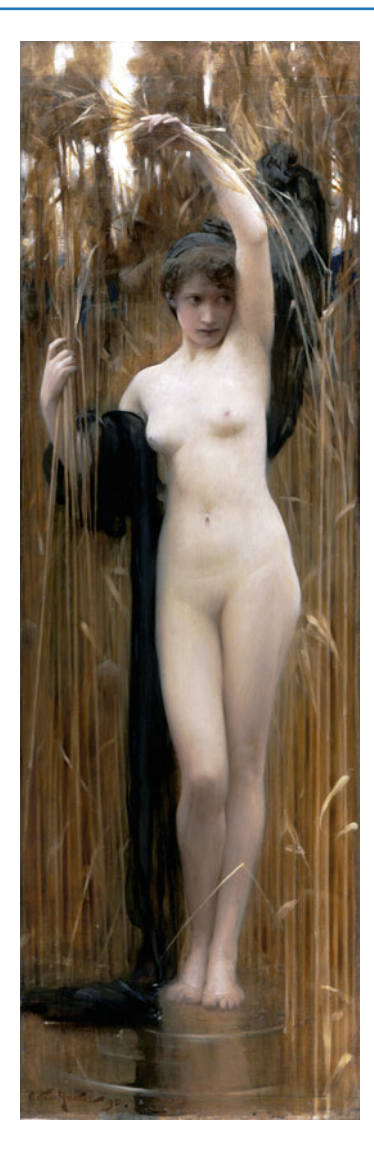
Fig. 22.9 Syrinx, Arthur Hacker, 1892 (Manchester Art Gallery, England)

Somewhat ironically, the name of the Roman goddess of love was attached to this very ancient sculpture by modern archaeology. The fundamental longing that is embodied in this figure also came to be embodied in many later images of goddesses, which can be traced continuously across several millennia, in the Near East and in the Mediterranean, down to the classical period of Greece. Greeks of this period are distinguished by their great enthusiasm for representing the beauty of the human body (Fox 2009), and, here too, it is mythological figures that predominate. This longing for beauty culminates in Praxiteles' (390–320