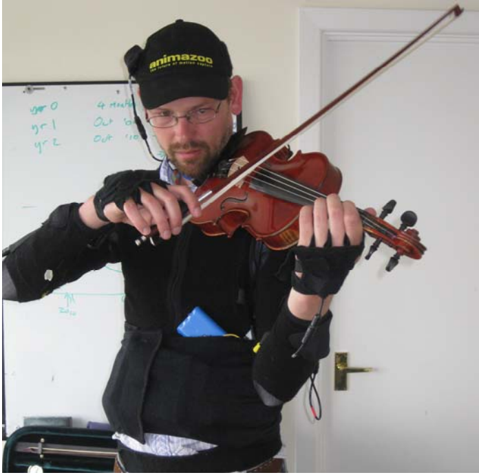
Fig. 3. A prototype of a motion capture and vibro-tactile feedback system for tracking and improving bowing actions when learning to play the violin [from 23]

We have also begun to develop vibro-tactile technologies that increase children’s awareness of their body posture when they are learning to play stringed instruments and when singing. Initial studies using motion capture technology to track bowing actions coupled with visual and vibro-tactile feedback have shown how different forms of multi-modal feedback that corresponds to ‘corrective’ tracking are effective techniques that can improve technique [see Fig. 3]. We are currently developing other engaging and playful tools that can motivate children to practice regularly [23].