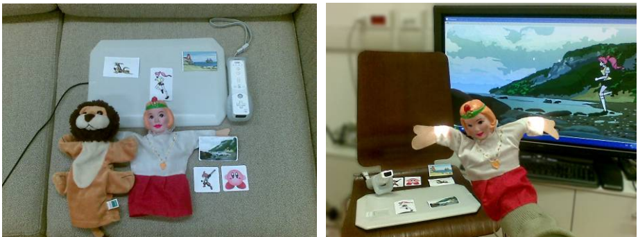
Fig. 2. iTheater components

The Puppet Interface was implemented using an IR vision system. Hand puppets were equipped with two infra-red (IR) leds placed on their arms. Puppet's movements were tracked by an IR camera able at the moment to recognize up to four IR lights, so that two it was possible to use two hand puppets at the same time (for this prototype we used the IR camera embedded into a Nintendo Wiimote Controller), allowing two users to play at the same time. The movement of the arms of the puppet are then tracked and interpreted. Movements that the user perform on the puppet are translated into various actions of the virtual character, including visual and audio effects, giving life to the virtual character. For this prototype, four pre-defined characters were created: the princess , the bubble man , the pirate and the dragon , with their own set of animations and audio effects. In addition to the movement of the virtual character in the screen, the player can induce his virtual character to perform pre-defined actions, depending on the profile of character chosen by the user. For example with a fast moving movement of the arms, the player can make the dragon to fly, or the pirate to fight, giving additional creative possibilities to the player.