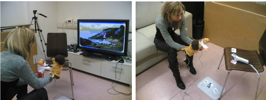
Fig. 3. Users interaction with iTheater system

The study was conducted with 10 users (5 Male and 5 Female) with different background (5 administrative workers, 4 researchers, 1 child;) and different age ranges (1 [< 10yy], 2 [20-25 yy], 4 [25-35 yy], 1 [35-45]yy, 2 [>45yy]) organized in three main stages: 1) demonstration of the main functionalities of the prototype, 2) direct usage of the iTheater prototype by users and 3) an interview based on a questionnaire regarding use and potentials of iTheater. Figure 3 shows two moments of the interaction of users with iTheater.