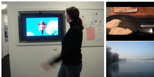
Fig. 2. A user passing a ReflectiveSign, and exemplary content