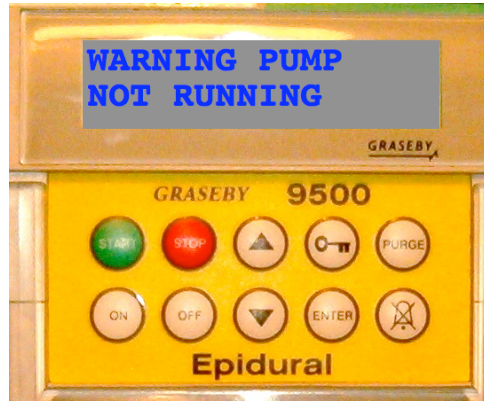
Fig. 1. Partial screen shot of the simulation—a user can mouse click on the buttons, which are animated to give simple visual feedback of pressing. Note that graph theory does not address all HCI issues, such as the naming or confusibility of buttons.