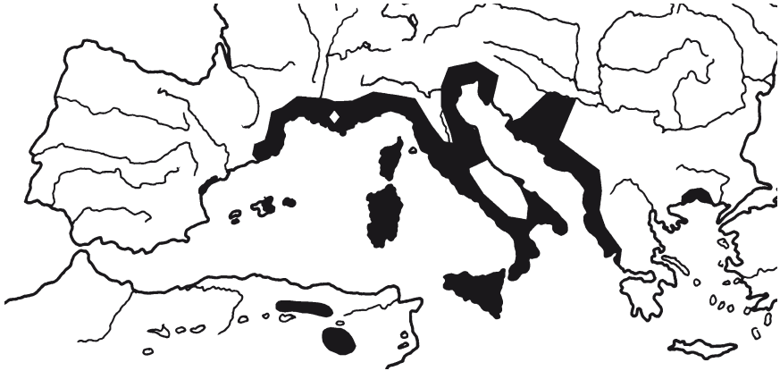
Fig. 1 Distribution of Calicotome spinosa . Tetraploid populations ( 2n=48, 50, 52 ) are found from Spain to Italy, while only one population in Var (France) was found to be diploid ( Diamond : 2n=24 ). Distribution map compiled from Aboucaya (1989) and de Bolós and Vigo (1984)