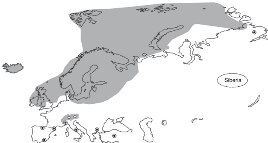
Fig. 4 Map of Eurasia showing the Last Glacial Maximum (LGM; ca. 20 ky BP), with the main identified refugia of European taxa (LGM from Svendsen et al. 2004; Ivy-Ochs et al. 2008). Small glaciated areas in Mediterranean mountains (not shown here) are discussed in Hughes et al. (2006). Filled circles : main refugia; Open circles : nunatak refugia

Other patterns of postglacial colonization have been described, from the refugia in central Asia or N Europe. The rare Alpine populations of the tetraploid Carex atrofusca originate from a central Asian refugium, while Siberia and Greenland populations form a sister clade (Schönswetter et al. 2006a). The diploid Ranunculus pygmaeus provides even a more extreme case as the Alpine populations probably originate from a refugium on the Taymyr Peninsula, East of the last glacial ice sheet (Schönswetter et al. 2006b). In Norway, the high nucleotide diversity of the populations of the root vole Microtus oeconomus from the island of Andøya strongly suggests in situ glacial survival for this species (Brunhoff et al. 2006). These examples show that the recolonization of the European ice sheet, after the last glacial maximum, took part from all directions, even if the contribution of the Southern refugia was prevalent (Fig. 4).