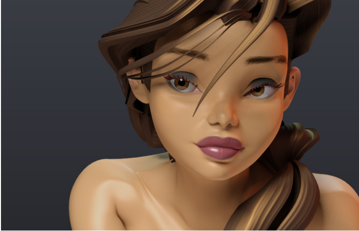
Fig. 1. The Girl character

script for the player to act happy. This would be very awkward and unrealistic since he just lost a good friend. Of course this could be solved with additional scripting, but this clearly does not scale. The scripts will become complicated and still there will always be situations and sequences of events that the developer did not think about.