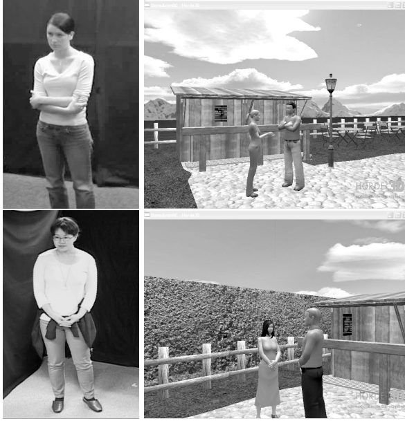
Fig. 3. First meeting examples. German sample from corpus study and generated interaction (above) vs. Japanese sample from corpus study and generated interaction (below).

API and provides lip-synching functionality on this basis. The German utterances are generated by the Loquendo TTS system. Unfortunately, the Japanese TTS does not implement the Speech API, thus we had to create our own Speech API compliant layer to interface the system to Horde3D. The choice of the TTS would in principle depend on the cultural background set by the Bayesian network. For the evaluation study this feature is disabled because the language would be a much too strong hint on the culture of the agents. Thus, the utterances are mapped to gibberish to prevent participants in the evaluation study to concentrate too much on what has been said.