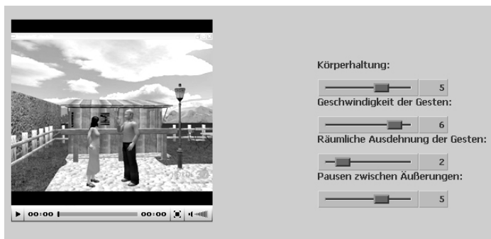
Fig. 4. Webinterface for the evaluation study

two agents that is tailored to the cultural background set for each agent. Thus, if the agents' behavior deviates from the user's expectations there should be an effect in the appraisal of this interaction compared to those that fit the user's expectations.