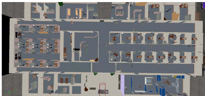
Fig. 1. A blue-print of the Hotel Arena, the virtual environment used for our experiments

Our experiments will be based on the 'Hotel Arena' that was used extensively during the RoboCup Rescue competitions of 2006 1 . Figure 1 shows a blue-print of this office-like environment. The wide vertical corridor in the center connects the lobby in the south with several horizontal corridors that go east and west. Numerous rooms border on all