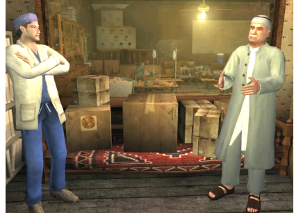
(b) Line 11 Doctor looks at the mayor while mayor is speaking to the captain