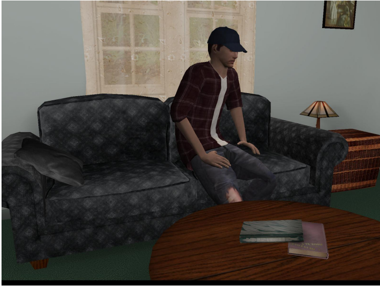
Fig. 2. Virtual Patient “Justin” in the clinician’s office