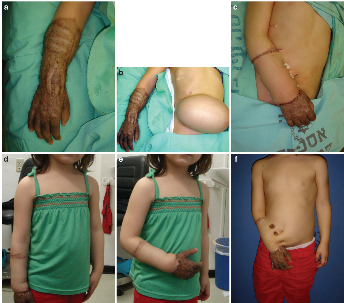
Fig. 69.8 a 3½ year old girl with a giant nevus extending circumferentially around the forearm from elbow to the hand and the fingers. b, c The arm is positioned against the flank and abdomen after expansion of the site. The forearm nevus is excised to the fascia level and the forearm is placed within the expanded pedicle flap. d The arm is placed for 3 weeks within the expanded “tunnel”, and the pedicle is gradually tightened

Although pedicled flaps are not readily available for coverage of more extensive lesions of the arm, thigh, or leg, the authors have had some success with expanded free flaps from the abdomen and scapular region. These