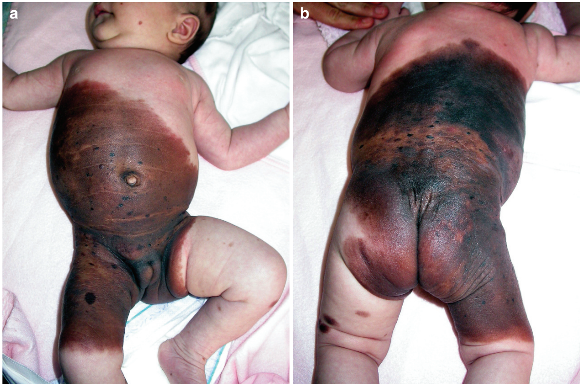
Fig. 69.1 a, b This infant female was born with a giant congenital melanocytic nevus covering large portions of her trunk with extension to lower extremities. This patient should be worked up for potential meningeal and cerebral melanosis

Congenital melanocytic nevi are composed of nevus cells of melanocytic origin, which vary in the amount of pigment they carry. At birth, these lesions can be quite faint. During the first 6 months of life, some nevi can appear to “grow” significantly as tardive pigment becomes more visible. Some satellite nevi may become visible for the first time over the first 2–3 years (tardive CMN). After the first 6 months, the lesions grow proportionally to the particular area of the body involved. The diameter of the lesion grows by a factor of 1.7 times in the head, 3.3 in thigh and leg, and 2.8 in the torso, arms, hands and feet. The