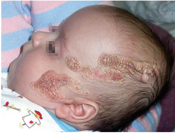
Fig. 69.2 A newborn boy with a large sebaceous nevus covering portion of the left scalp, lateral forehead, lateral temporal area and the cheek. Clinically, these lesions are significant for a chance of development of a basal cell carcinoma later in life