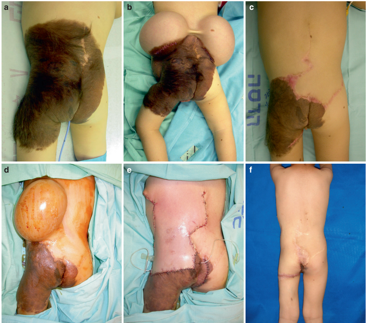
Fig. 69.7 a Patient with a bathing trunk nevus starting at the junction of the middle and lower of the back and covering the entire buttocks, perineum and the left thigh circumferentially. b, c After expansion of the upper back, two large medially based flaps are transposed to reconstruct the lower trunk. d, e These

flaps can be re-expanded to allow for further nevus excision. f View after four rounds of tissue expansion and near total nevus excision (a small rim of nevus was left around the anus to prevent scarring in this area that may lead to incontinence of the sphincter)