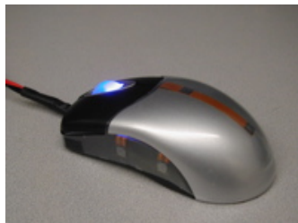
Fig. 1. Pressure mouse sensor

These human observations in the classroom are continuing as a way to understand the impact of student emotions on learning. Yet these student emotions can be detected automatically by intelligent tutors, which can then also respond dynamically with appropriate interventions. In order to establish a social and emotional connection with students, tutors should recognize students' affect and respond to them at a deep level. Towards this end, our goal in the second phase was to automate the observation process using sensors. We have developed a low cost multi-modal sensor platform that is being integrated into the Wayang Tutor and evaluated in classrooms. The platform includes a custom produced Pressure Mouse, a Wireless BlueTooth Skin Conductance sensor, a Posture Analysis Seat, and a Facial Expression System. This platform expands on an earlier one at an order of magnitude reduction in the overall cost. The sensors are developed from an earlier system that had several sensors in common with AutoTutor [9]. Pre-production prototypes of each sensor have been developed and we are producing thirty sets of these sensor platforms for simultaneous use in classrooms. The intent is to provide a better understanding of student behavior and affect and to determine the contribution of each sensor to the modeling of affect [14].