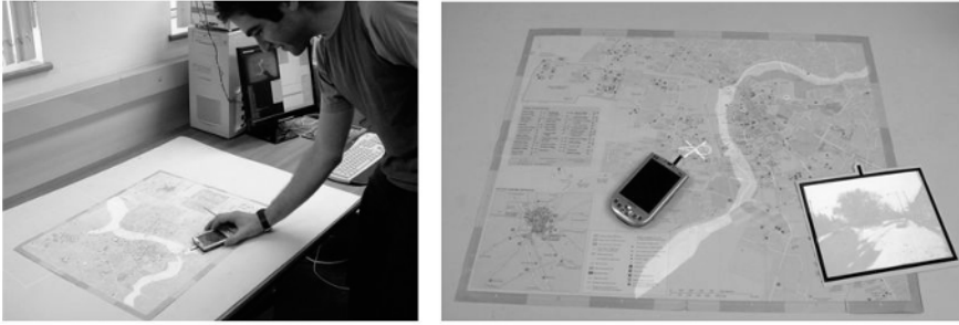
Fig. 1. (Left) a user interacting with an augmented map, (right) overview of the individual tools and example augmentation of the expanded river

A second interaction device provides control over entities referenced to map locations. A Windows CE -based Personal Digital Assistant (PDA) device is located using the screen rectangle which appears almost black in the video image. Again a pointer is present on the top of the device to accurately determine a location. An active entity referenced to a location presents a dedicated user interface on the PDA. Typically the user interface is persistent on the PDA until a new one replaces it. Therefore users can pick up the PDA from the table surface again and operate it in a more comfortable hand-held manner.