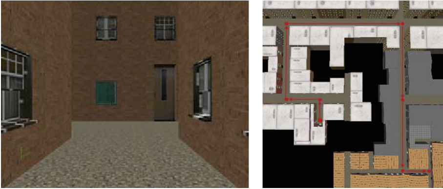
Fig. 1. The virtual city as seen from navigation perspective (left side) and from bird's eye view with the route marked in red (right side). During learning the start, the end and each of the six intersections in-between were marked with white crosses on the floor (marked by red dots in this figure). They served as locations to be teleported to and as targets during the test phase.