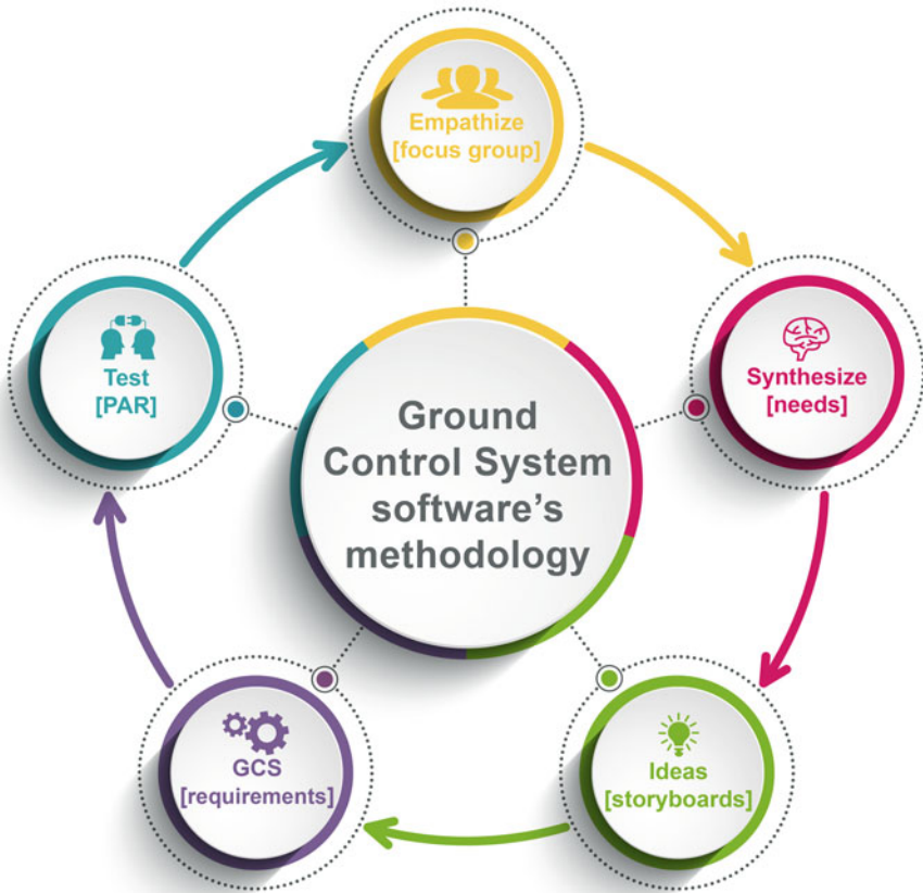
Fig. 1 Methodologies used in the design of the Ground Control System (GCS) software.

implementing tools that enable new flows of thought based on intuition, critical thinking and creativity (Brown 2009).