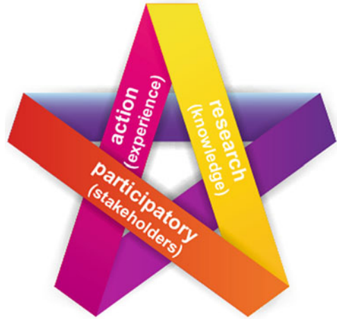
Fig. 4 Participation, action and research interoperation generates PAR methodology.

is an integral part of the innovation process (Plattner 2010). Therefore, this phase carries out many other implicit goals. The AiRT RPAS is a complex system that involves a high-end Indoor Positioning System (IPS) technology that was in beta stage of development. AiRT RPAS can be seen as a real-world test bench for the IPS. A new drone was also developed in order to match the requirements of an indoor drone with support for professional cameras. This drone had its own standard Flight Control System (FCS). Finally, the Ground Control System (GCS) connects wirelessly to an On-board Control System (OCS). During this phase, all components of the system, FCS, OCS, GCS and IPS were integrated. Meanwhile, a software prototype that implemented the functionalities of the AiRT system was developed. This software runs on the GCS. It has to communicate bidirectionally with the server process running on the OCS. The design of this software was based on prioritised requirements, with the goal of making the solutions visible. The Human-Computer Interface of the software (user interface) was based on the heuristic analysis of the information extracted from the storyboards done in the previous stage.