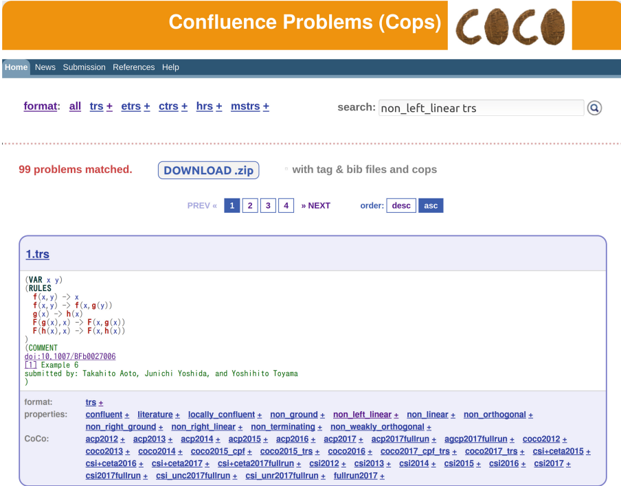
Fig. 1. The web interface of Cops.

Tags. Cops has no directory structure. Instead, tags —which can be seen as a multi-dimensional directory structure—are assigned to problems. Different kinds of tags are supported. On the one hand, properties of rewrite systems like left-linearity, groundness, and termination are useful to filter the database for those problems that are supported by a particular tool or technique. These include the tags to distinguish the four different input formats, and they are automatically computed when problems are submitted. A second category of tags refers to tools that could solve the problem (i.e., prove or disprove confluence) in earlier confluence competitions. An example is acp2017 which is assigned to all problems selected for CoCo 2017 that were solved by ACP [2].