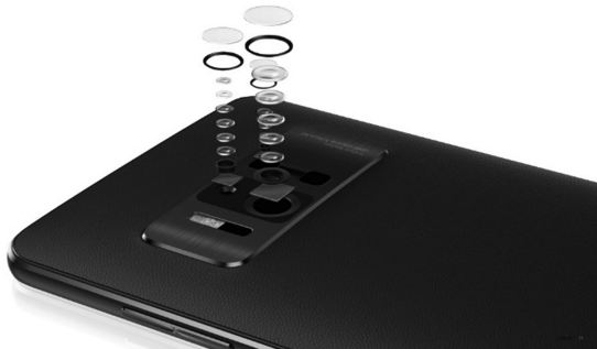
Fig. 5. Asus Zenfone AR compatible with Project Tango

The second technique is more complex from a technical point of view. It consists of “augmenting” the “reality” of a real object on itself with no need of any marker, that is, analysing the object’s morphological features to place the virtual objects in the space. This way, the visitor is able to move freely around the artefact with no restrictions for the AR elements to be displayed. For the moment, the most effective system to carry out this technique is the Tango Project developed by Google. It has to be used in special smartphones with additional environment sensors, which, together with regular sensors (accelerometer, compass ...), are the basis for the Motion Tracking, Area Learning and Depth Perception technology. (Note: by now there are only two available devices: Lenovo Phab 2 Pro and Asus Zenfone AR) (Fig. 5) Tango was the chosen technique for the musealization of the Cité de l’Architecture et du Patrimoine (Palais de Chaillot, Paris) , where the visitor is able to view virtual reconstructions just by framing the artefacts from any point of view (Cannella 2017).