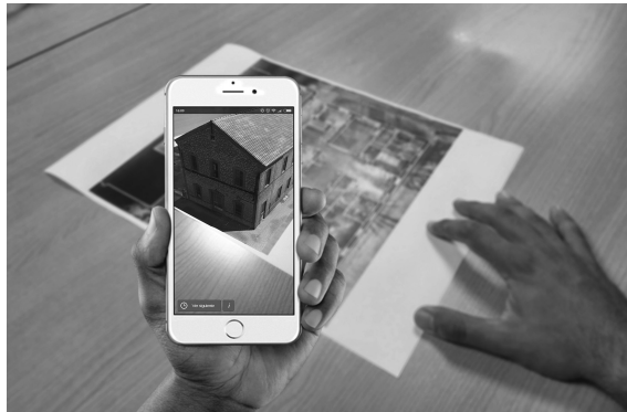
Fig. 4. AR application developed for Fontilles. Central Pavilion

Just as the VR, Augmented Reality has also numerous applications in the field of cultural heritage dissemination (Fig. 4). Sometimes, despite the great effort to disseminate historical and constructive studies, the understanding of some archaeological remains is still difficult for most of the visitors. The loss of volumes, coatings and colours affect the historical vestige realisation (Pagliano 2017) and a reintegration, perhaps virtual, of an object or a historical architecture is needed.