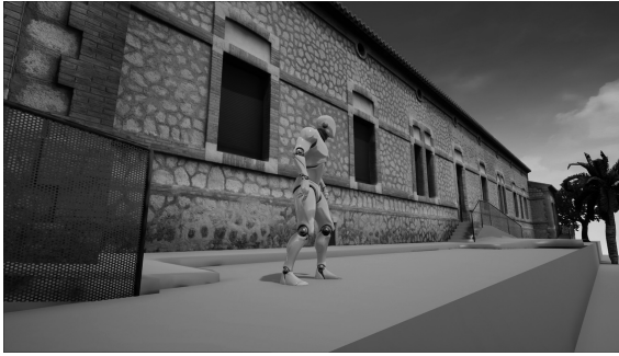
Fig. 2. VR application developed for Fontilles. Virgen de los Desamparados pavilion

cloister, in Barcelona (Cabezos and Rossi 2017). This paper emphasizes the complete process of the virtual museum creation: from the capitals surveying using digital photogrammetry to their virtual exhibition through SketchFab.