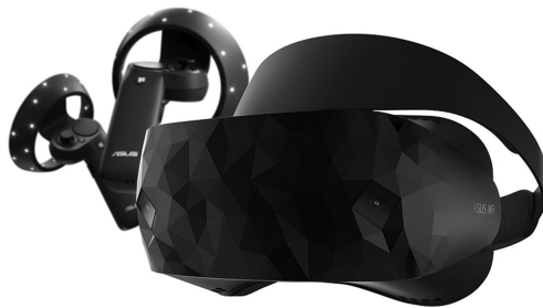
Fig. 1. Mixed Reality glasses of the Asus Company. They contain front cameras

For them to be disseminated, it is possible to use some techniques that are widely used in other fields of knowledge such as medical science or architectural design. We are speaking about Virtual Reality and Augmented Reality. Recently, a new technique combining the previous two has broken into the ICT landscape: It is called Mixed Reality (Fig. 1). Next, we analyse the potential of these techniques for the dissemination and preservation of cultural heritage.