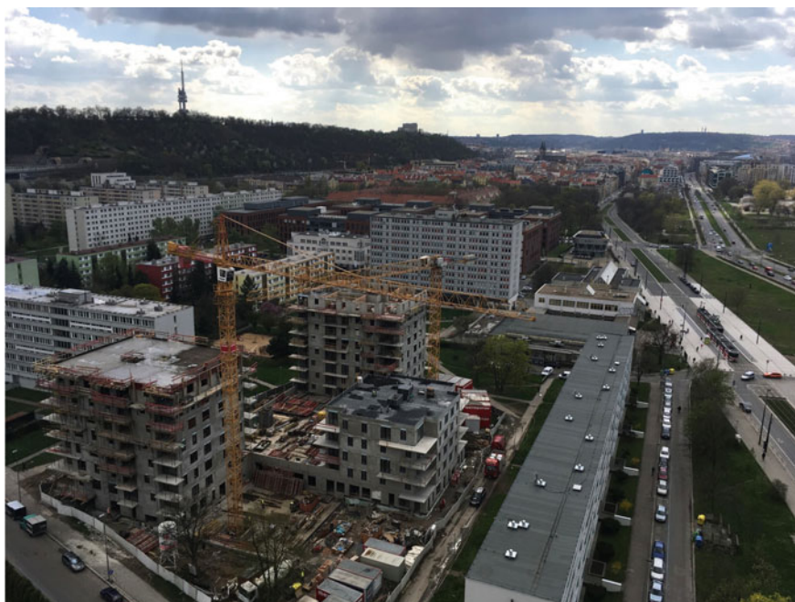
Fig. 15.4 Karlín Park, a new residential project on the site of a former kindergarten, is located in the core of the Invalidovna housing estate.

contains several suggestions of activities to improve the quality of life specifically aimed at housing estate neighbourhoods.