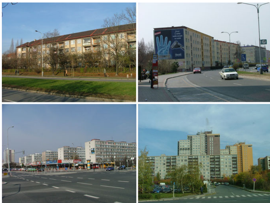
Fig. 15.2 Examples of housing estates in Prague: from top left, Solidarity (built during 1947–1949), Antala Staška (1954–1955), Pankrác (1964–1970) and South Town (1972–1992).