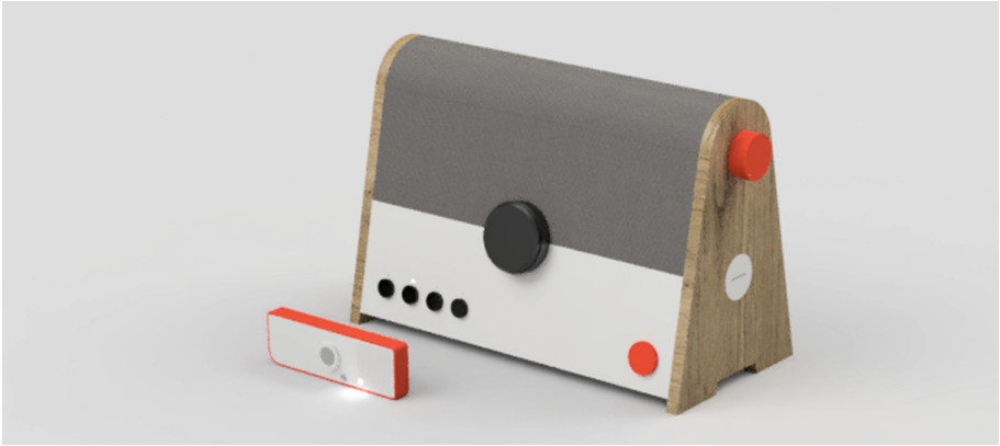
Fig. 3. The final designed system

At the center of the interface is the Haptic Engine (H.E.). The H.E. is a dial that doubles as a loci of both input and output. While a clip plays the H.E. - similar to a record player - will slowly rotate, making a full revolution every ten seconds. Equipped with capacitive touch sensors it will disengage the motor and pause playback when held. Manual rotation enables users to browse their collection in time. Continuous rotation will make one jump through the collection in larger intervals. Users can keep track of their position within their collection through a 16 \times 8 LED matrix depicting the date (in a MM-YY format). The LED matrix is situated behind the speaker cloth. When the LED's are off the matrix practically disappears.