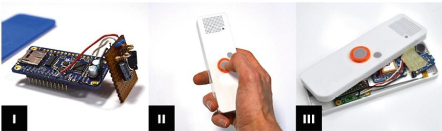
Fig. 1. Images of the main iterations of the recorder.

Dibs' and Oleksik's, research participants requested tools to create short yet significant clips from their longer recordings, confirming the desire for an event-focused reminiscing. To answer this need we fixed the length of each recording to 10 s exactly. In this way the user would be encouraged to treat a recording at the onset actively as an (physically ephemeral) event instead of an indistinct variable-length documentation, but the disruption of any ongoing personal or environmental interaction would be minimized. Fixing the length of the clip also rendered pause and stop button superfluous; a single button would accomplish the entire process and it would not even be necessary to pay visual attention to it. A working mono-recorder was built as proof of concept (see Fig. 1(i)).