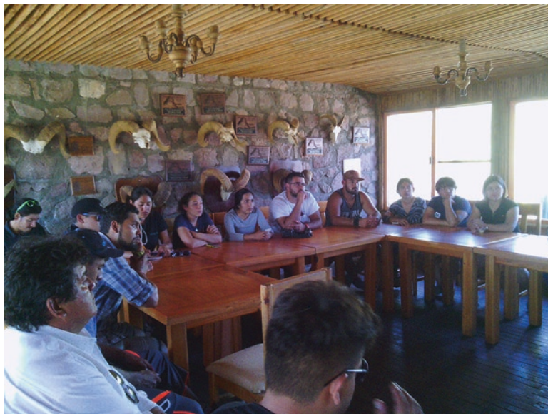
Fig. 18.7 Bighorn sheep hunting visiting center in UMA Bonfil (Eduardo Juárez 2017)

and (b) expanding the population census not only to locate suitable males, but to have information on the juveniles and their development.