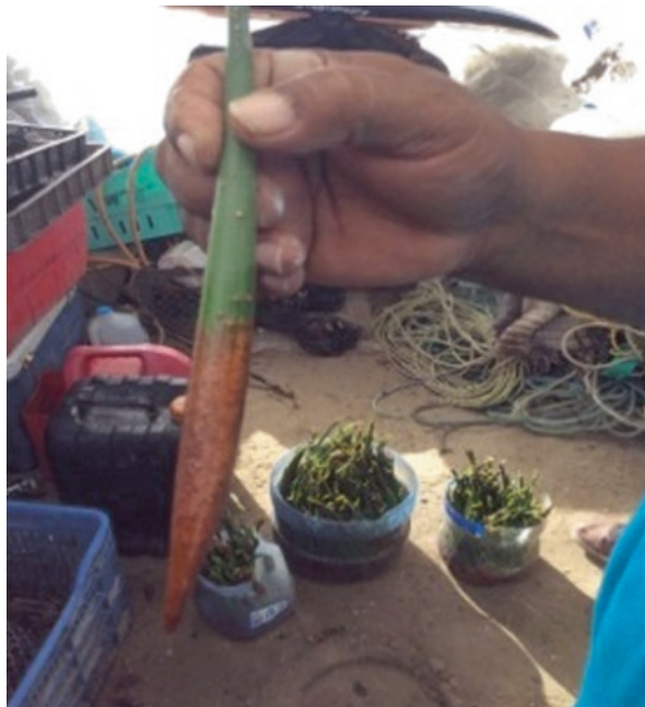
Fig. 18.5 Growing mangrove propagules in Campo Delgadito (Antonina Ivanova 2017)