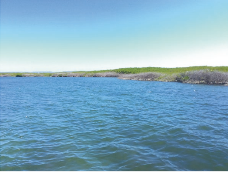
Fig. 18.3 Climate change effects on mangroves, Campo Delgadito (Antonina Ivanova 2017)

As fisheries are affected by changes in climate, overexploitation of resources, pollution, and bad practices, mangroves of Laguna San Ignacio are considered key to conservation and the locals' economy and food security (CONANP 2016). Mangroves play an important role in keeping water free of pollutants and reducing pressures from high temperatures (Wildcoast 2016b), and inhabitants of Campo Delgadito recognize that mangroves protect their community from hurricanes, storms, and floods. Fishermen get most of their products from the open sea, but they acknowledge that mangroves play an important role as food banks and protection sites for the species they capture: without mangroves fishing would not be possible, since mangroves protect both fish and shellfish. 6 However, in recent years, mangroves have been adversely affected by climate change (Bautista González 2014): In Campo Delgadito, a high mortality of white mangrove has recently been noted (Fig. 18.3), due to the proliferation of some species of algae that surrounds its roots and dries them. 7