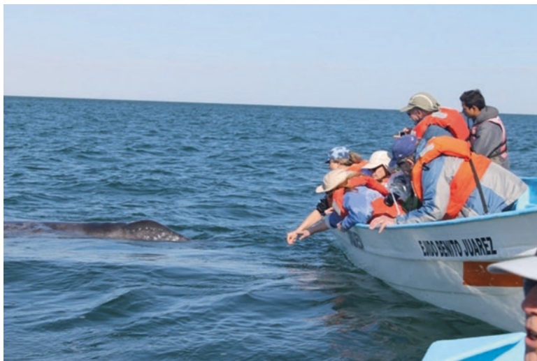
Fig. 18.1 Gray whale watching in Laguna Ojo de Liebre