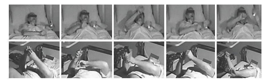
Fig. 12.2 Video recordings (selected frames) of oneiric stupor in two patients with Morvan's syndrome. Both patients perform the same gestures mimicking daily-life activities such as searching for objects