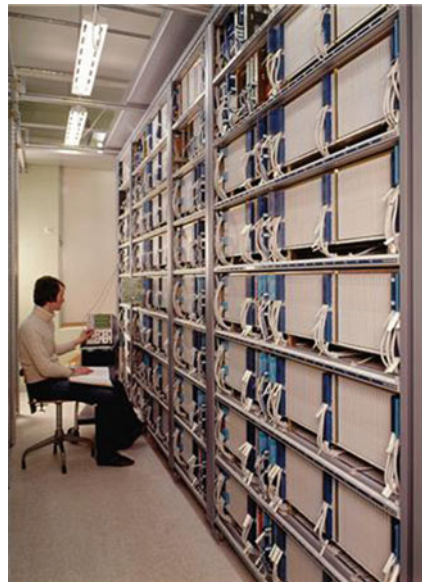
Fig. 12.1 AXE system.

The analog system uses an electric current to convey the vibrations of the human voice, whereas a digital system uses a stream of binary digits to represent sound. The AXE system was an immediate success with telecom companies, and it has