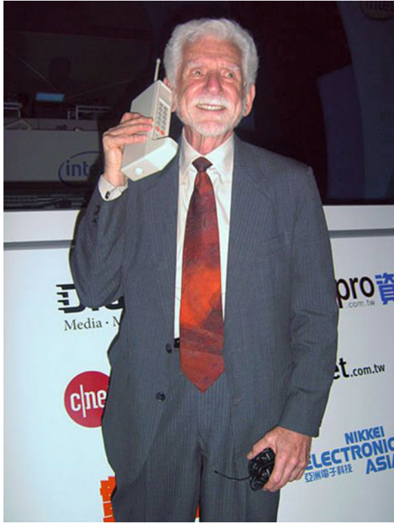
Fig. 12.3 Martin Cooper re-enacts DynaTAC call

and 900 MHz. Each service provider could use half of the 824–849 MHz range for receiving signals from cellular phones and half the 869–894 MHz range for transmitting to cellular phones. The bands were divided into 30 kHz sub-bands called channels and a separate frequency (or channel) was used for each conversation. The division of the spectrum into sub-band channels is achieved by using frequency division multiple access (FDMA).