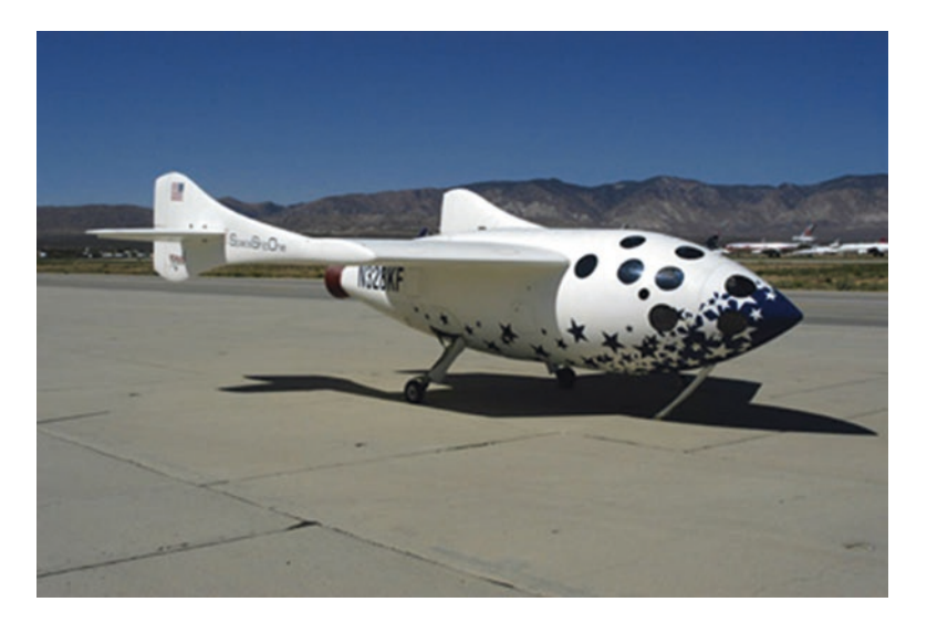
Fig. 1.3 The SpaceShipOne, winner of the Ansari XPrize competition that fueled a NewSpace commercial revolution.

As the NewSpace revolution continues to unfold, and new ways of looking at commercial space systems develop, one may see yet other space applications in coming years. In short the dynamic history of small satellites and how they are designed, built, and launched is still unfolding. In the early days of space the creation and building of launch vehicles and of spacecraft was consigned to large space agencies and giant aerospace corporations. Today these rules no longer stand. Just as Silicon Valley transformed the world of computers and networking, the world of small satellites is changing how we think about space.