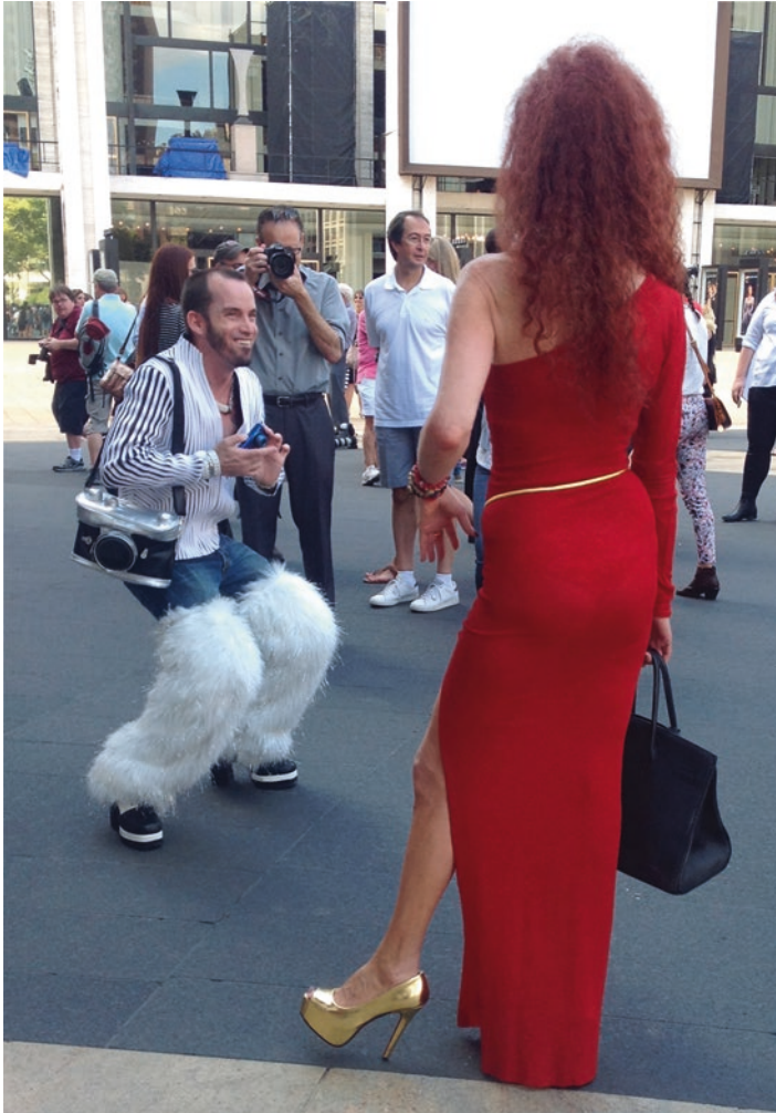
Fig. 6.4 Dresses that are moulded to the body like a glove