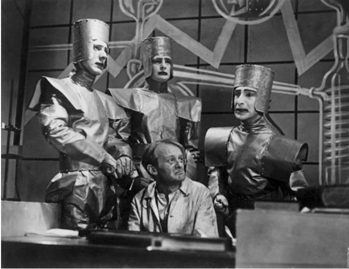
Fig. 10.7 A performance of Karl Capek's RUR in 1921. Capek's play introduced the term "robot" in describing how they revolt against humanity

Stapledon's "last men" or Karl Capek's "robots" (Fig. 10.7) to the "science-fiction" of Hugo Gernsback's Amazing Stories (Fig. 10.8) or E.E. "Doc" Smith's The Skylark of Space (1958 [1928]).