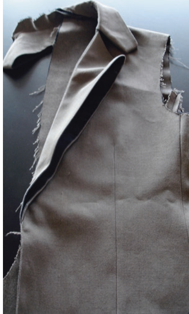
Fig. 8.3 At some point, the processes of becoming in-spired —that is, possessed by the zeitgeist —need to be materialized in a concrete prototype, for instance, an “open-lapel jacket”