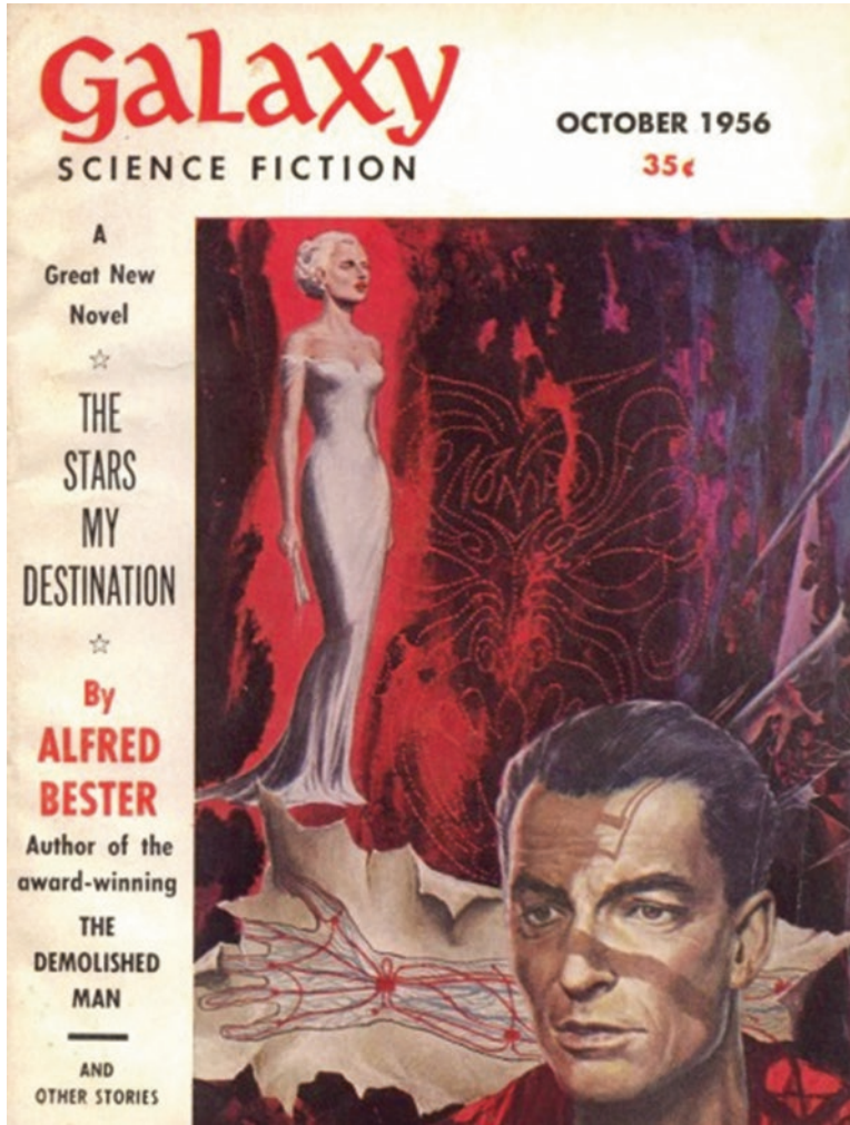
Fig. 10.2 The 1956 cover of Galaxy Science Fiction , containing the original version of Alfred Bester's The Stars My Destination

focus on cultural transformation should lead us to ask when and how, and, not least, which science was fictionalized (cf. Stableford et al. 1993). If, indeed, science fiction sacralizes the objects of secular scientific attention (Pels 2013), it cannot emerge unless science and the secular have