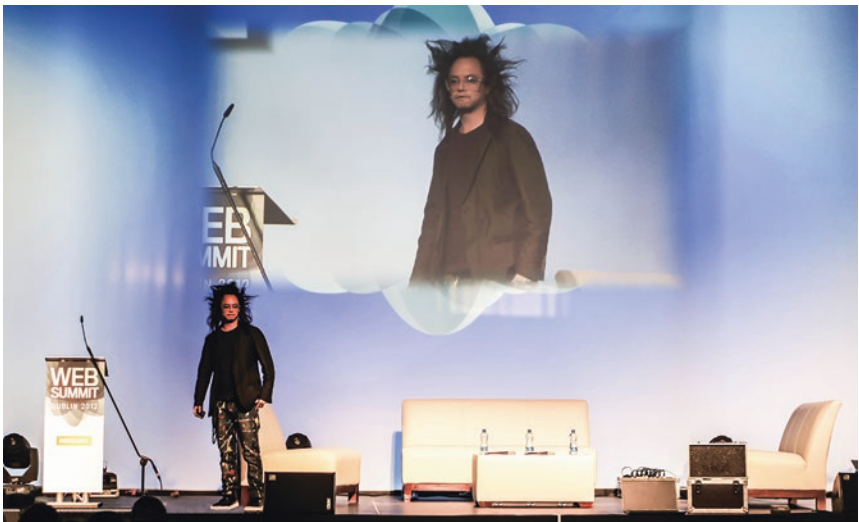
Fig. 7.1 AOL’s “Digital Creative Prophet” David Shing—Web Summit 2012

Bourdieu notes the charismatic individual is known for discovering “brilliant” ideas that otherwise would remain anonymous (1993: 76). The creative artist is thus venerated above ordinary men for discovering