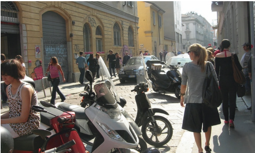
Fig. 8.1 With heightened sensitivity and attentiveness to everything and everyone around them, a group of fashion designers are on a so-called inspiration trip to Milan

It is hard to conceive, I believe, of a more accurate way of describing the heightened sensitivity and responsiveness of the designers in Milan. Like numerous other hunters, the designers are present at the continuous birth of the world (ibid. 12)—that is, at the fact that things are in life—for which reason they are not turned in upon themselves but open to the world around them (cf. Ingold 2007: 31–32). A designer, it was both stressed and enacted, has to be open-minded, never taking things as they are, always approaching life as a process of on-going generation. Faced with the uncertainty of designing, here and now, what is yet to come, it was not merely critical that the designers left their daily surroundings in order to immerse themselves in a setting marked off from the ordinary. What is more, they related to this setting in a particular way, almost as though they, at each moment, opened their eyes to the world for the first time (cf. Ingold 2006: 12). One significant aspect of the processes of inspiration thus entailed a distinct condition of being alive and open to the world (Fig. 8.1).