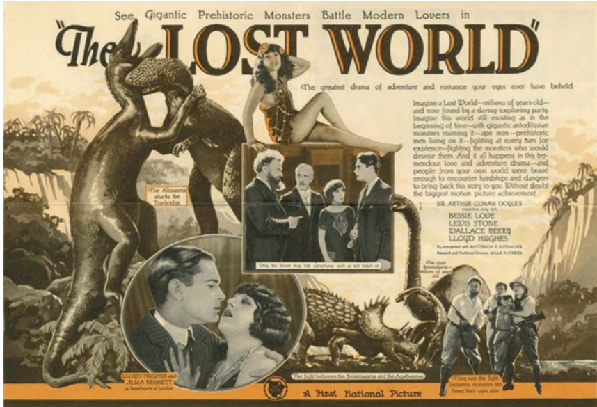
Fig. 10.6 Advertising poster for the first (1925) film version of Conan Doyle's The Lost World by Harry Hoyt. Early film was overwhelmingly devoted to magic and science fiction, as the predominance of film versions of She and King Solomon's Mines shows (Leibfried 2000)

Challenger encountered was surely one reason why The Lost World (published in 1912) was turned into blockbuster cinema already in 1925 (Fig. 10.6). It has continued to do so in Spielberg's Jurassic Park and The Lost World in the 1990s, although the anchoring in anthropology was lost in the process of turning from evolutionary racism to a more subtle racial metaphor in genetic technology.