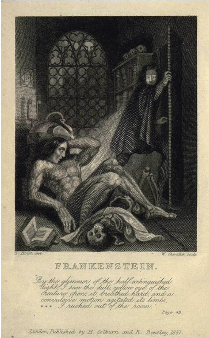
Fig. 10.3 Frontispiece of the original 1818 edition of Frankenstein , showing the confusion and innocence of the "monster" before it turns evil, and Frankenstein's horror at his own creation