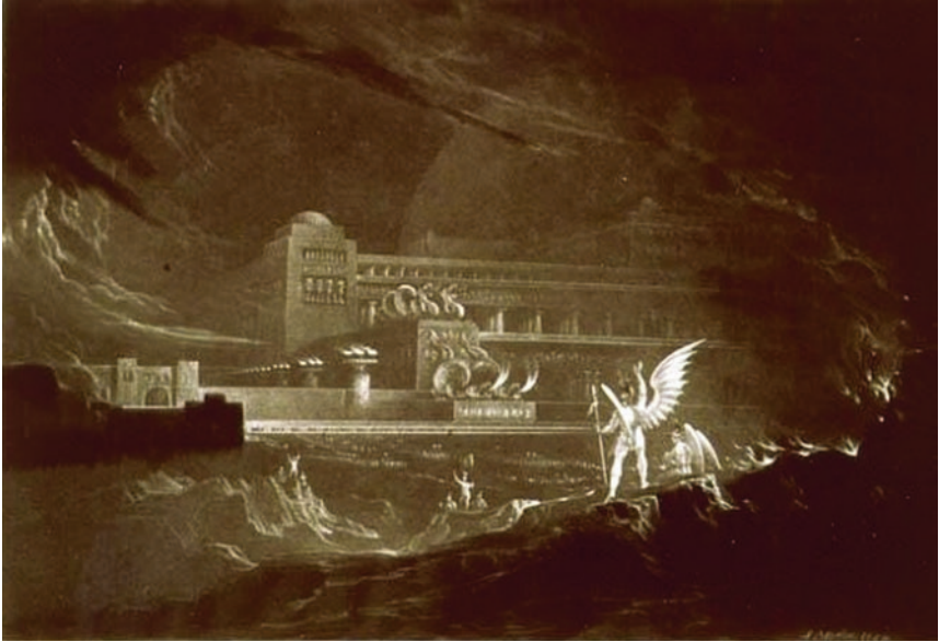
Fig. 10.4 A version of John Martin, Pandemonium (ca. 1825), originally meant to illustrate a scene in which devils build Hell in Milton's Paradise Lost . This painter's architecture is compared to that of the Vril-ya in Lytton's The Coming Race , and this version of the painting adorns the cover of a late twentieth-century edition of the book

kinship and matriarchy around the 1850s—could thereby become the raw material from which a novel like The Coming Race could be composed.