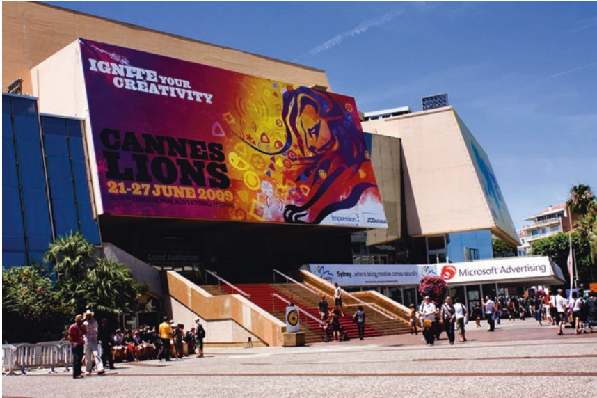
Fig. 7.2 The advertising awards ceremony at Cannes, France

time, with certain objectives and evaluations carried out. They offer a frame of analysis for understanding specific roles, relations, and divisions in the agency world (Goffman 1979; Malefyt and Morais 2012; Moeran 2005: 43–57). Likewise, rituals in magic require exact strictures and boundaries to work. Malinowski explains: “First of all, magic is surrounded by strict conditions: exact remembrances of a spell, impeccable performance of the rite, unswerving adhesion to the taboos and observances which shackle the magician. If any one of these is neglected, the failure of magic follows” (1954: 85). This ritual framework is essential for magic and for enhancing the aura of an artist. For this, creatives regularly attend award ceremonies to magically imbue their names with power.