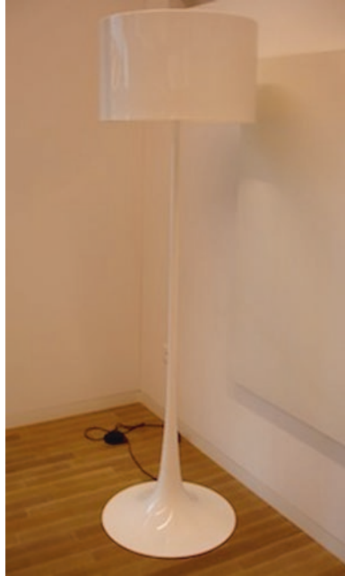
Fig. 8.2 Certain things may be so inspiring that they “speak” to you. “Talking with” a lamp, for instance, may enable a fashion designer to envisage a fashion collection from a new perspective