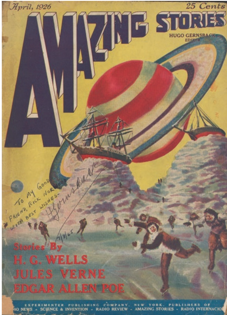
Fig. 10.8 The first cover of Amazing Stories , edited by Hugo Gernsback, of April 1926