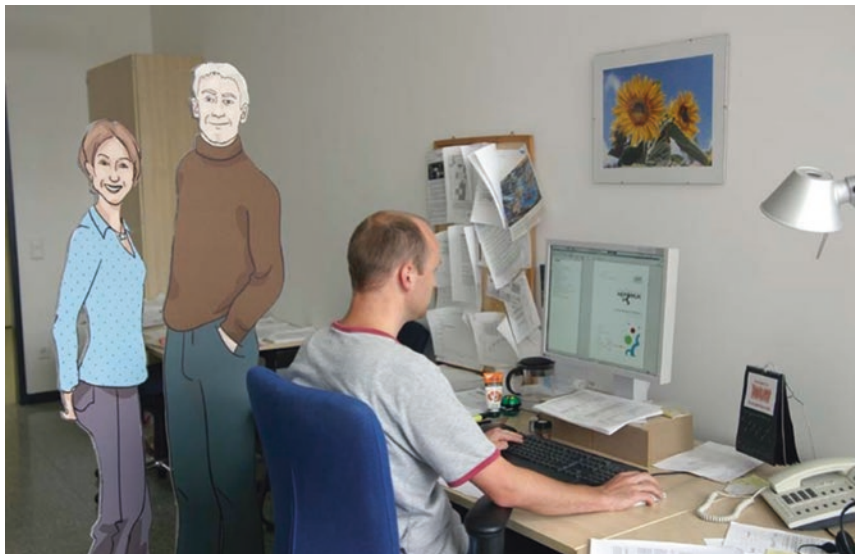
Fig. 5.1 Photo of persona developed in a corporate setting