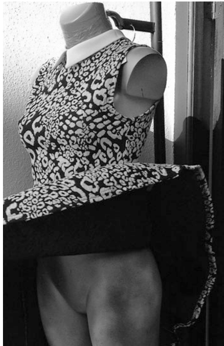
Fig. 6.1 Sleeves are magic

It’s clear that those writing for fashion magazines also regard fashion as in some sense “magical.” We find the word used to title fashion stories ( White Magic; Animal Magic ); describe new fashion collections ( Here’s how the costume designers, hair stylists, and makeup artists make the magic happen ) and individual garments ( Sleeves are magic. Now you see them, now you don’t ); (Fig. 6.1) and generally account for designers and their work ( The name Dior is absolutely magical ). Magazines cast numerological spells: 5 spring must-haves, 49 wanna-buy-now swimsuits, 138 figure-fixers, 275 objects of desire, and 394 smart ways to look sexy . They ensorcel with sassy suits, slinky jerseys, bold collars, saucy stilettos, and adventurous