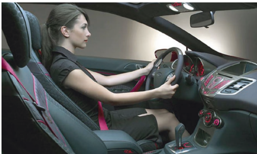
Fig. 5.2 Ford factish