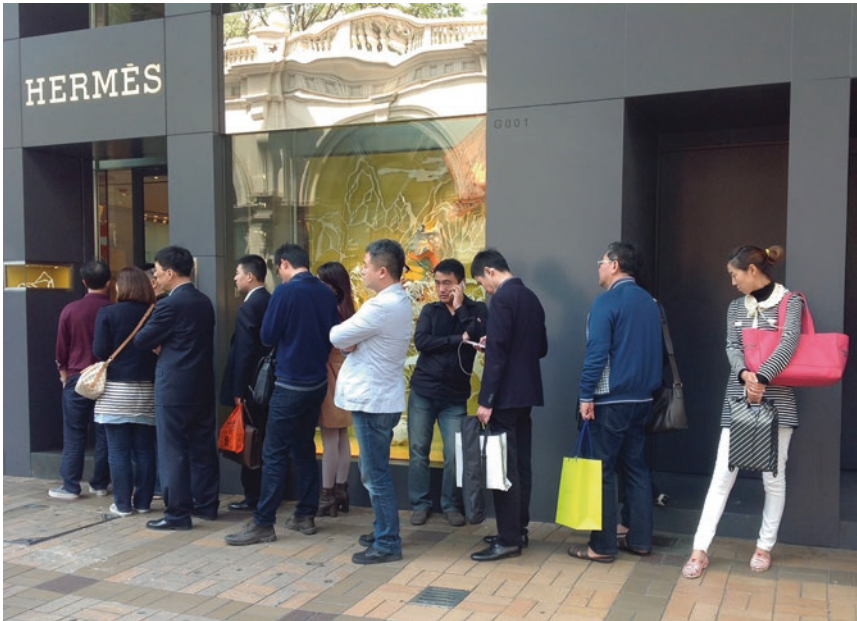
Fig. 6.2 Waiting at Hermès to buy the glam

Fashion magazines, and the fashion world they depict in their glossy pages, are all about glamour ( high-octane glamour mixes with street style ). Just how glamour works, though, is never quite certain and those who