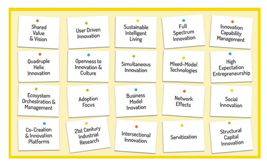
Fig. 3 20 drivers for Open Innovation 2.0