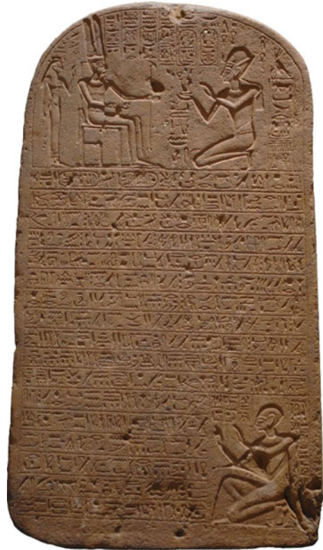
Fig. 13 The Stela