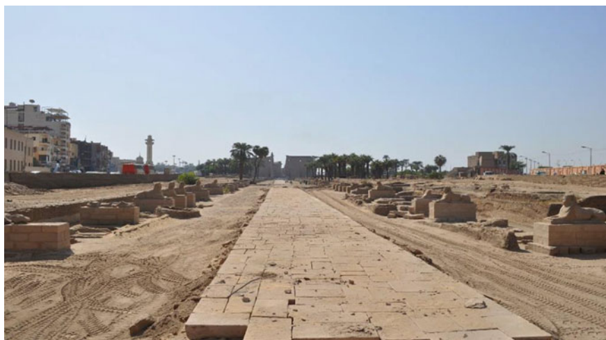
Fig. 7 The sector in front of Luxor after excavations

in the middle of the site about 20 m to the North of the mosque of Almeqashqesh. This was dug during my work in the salvation of Karnak and Luxor Temples dewatering project in 2003. Here was found a sphinx on the western side of the area, with red brick circular planters and pavement, but there were no traces for the eastern row (Fig. 5).