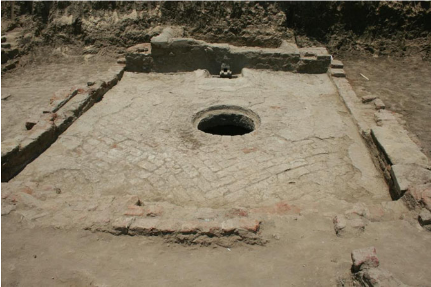
Fig. 11 The wine cistern