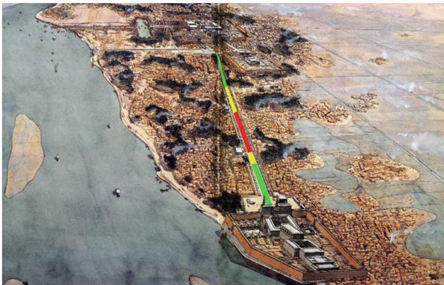
Fig. 3 Sector of the Avenue