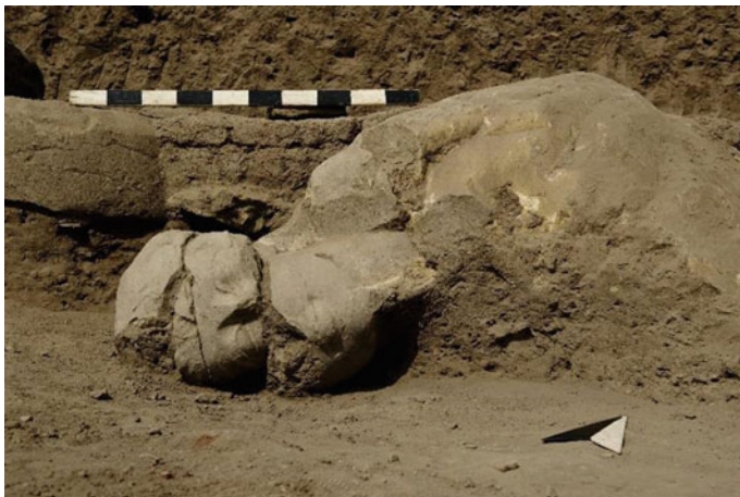
Fig. 5 One of sphinxes as found

This sector comprises the area of Khaled ibn El-Waleed garden and the Avenue of Sphinxes from Luxor temple until the dismantled police station. The excavations started in this sector after completing the demolition of the police station and after mechanically removing the paved asphalt road between it and the mosque of Almeqashqesh. A trench excavations measuring 24 m × 2 m extended East–West