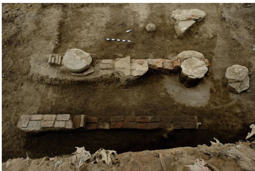
Fig. 10 Menkherperre Chaple