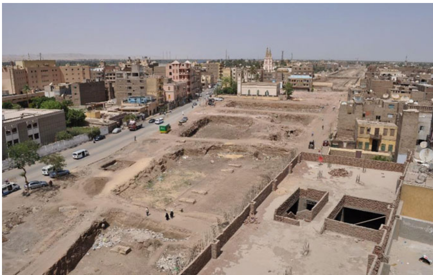
Fig. 8 The second sector during the excavations

Two long NE–SW trenches were dug which exposed the western and southern row of the sphinxes associated with red brick tree pit. The North-eastern row is severely damaged, while the South-western one is relatively better preserved, with some sphinxes broken in pieces.