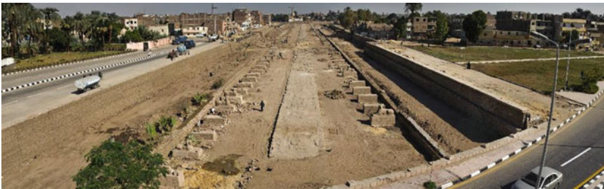
Fig. 12 Wine installation