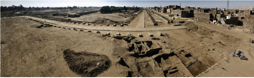
Fig. 18 Connection to Mut temple and Nile River

during the first cleaning of the upper phase of the site and at a depth about 50 cm from the surface level, behind sphinxes no. 48–49 (Fig. 17). It has 17 horizontal lines of text and measures 132 cm height \times 77 cm in width \times 28 cm thickness. It is dated to the 4th regnal year, the, highest attested date, of Setnakht, the first king of the 20th dynasty. Of particular interest in the main text is the theme of the discovery of damage of an ancestral and divine monument as a symbol of the effects of disorder, this followed by the reversal of such effects by restoring the monument and a dedication offering by Bakenkhonsu (Boraik, 2007a, b). And also a rounded-top private stela in sand stone in sunken relief was also found. It bears the representation of a man standing in front of God Amun and his wife Goddess Mut. The stela may