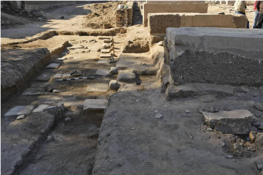
Fig. 20 The platform of the flads holder

This sector is called Shaikh Moussa Bridge, named after the bridge that existed over the ditch of Chevrier. This site covers a surface of 474 m in length and 54 m in width. It extends from the Airport road towards the North of the avenue that leads to Mut temple. In 1992, El Saghier discovered in this site the remains of twenty deteriorated sphinxes, fourteen on the western and of six on the eastern row. These