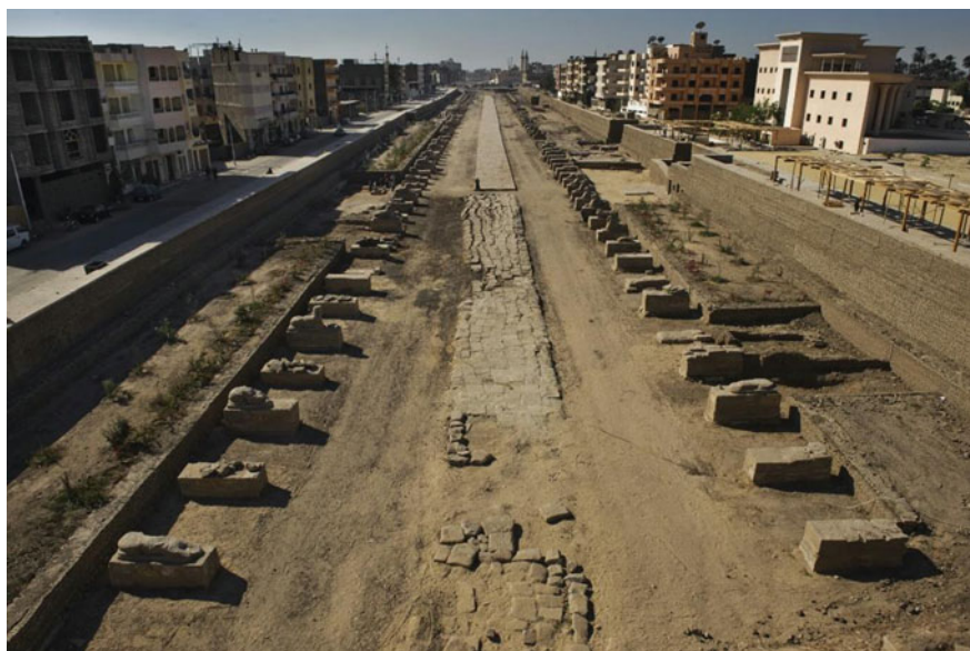
Fig. 14 Portion of the Avenue Sector IV

The excavations brought to light also that this area was used as an industrial area during the Roman period. A series red brick walls extended from the South to the North just behind the sphinx pedestals. A wine installation was found on the West row of the sphinxes dating back to the Roman period and, most likely, was in use through the Byzantine period (Fig. 12). The winery extends 19.5 m South–North and 24 m East–West. Its eastern façade is 1.60 m high. The preliminary study of the pottery indicates that this winery was used until the 3rd Century A.D. A sandstone block measuring 120 \times 70 cm has circular holes with two crosses (most likely Coptic) carved next to them. In the walls of the building next to the winery, remains of a royal stela were found which possibly dated into the end of the Pharaonic periods. It measures 50 \times 40 cm and portrays a king kneeling in front of god Amun-Re and offering the NW bowls (Fig. 13).