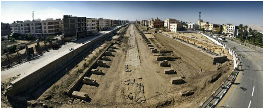
Fig. 23 The new retaining wall

First, a sandstone retaining slope wall was constructed on the both sides of the avenue (Fig. 23). After we finished the sector V behind the library, the vision was nor matched with the avenue. This concept turned the Sphinxes Avenue to look like a dry water canal. Secondly, with the idea of Antiquities Department, a concrete vertical wall was built along the both sides of the road and cased with mudbricks (Fig. 24). Also, every 600 m we constructed a ramps as visitor access to the road