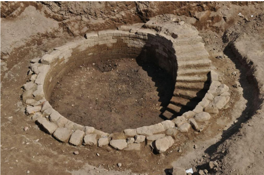
Fig. 19 The water well with its staircase

during the first cleaning of the upper phase of the site and at a depth about 50 cm from the surface level, behind sphinxes no. 48–49 (Fig. 17). It has 17 horizontal lines of text and measures 132 cm height \times 77 cm in width \times 28 cm thickness. It is dated to the 4th regnal year, the, highest attested date, of Setnakht, the first king of the 20th dynasty. Of particular interest in the main text is the theme of the discovery of damage of an ancestral and divine monument as a symbol of the effects of disorder, this followed by the reversal of such effects by restoring the monument and a dedication offering by Bakenkhonsu (Boraik, 2007a, b). And also a rounded-top private stela in sand stone in sunken relief was also found. It bears the representation of a man standing in front of God Amun and his wife Goddess Mut. The stela may