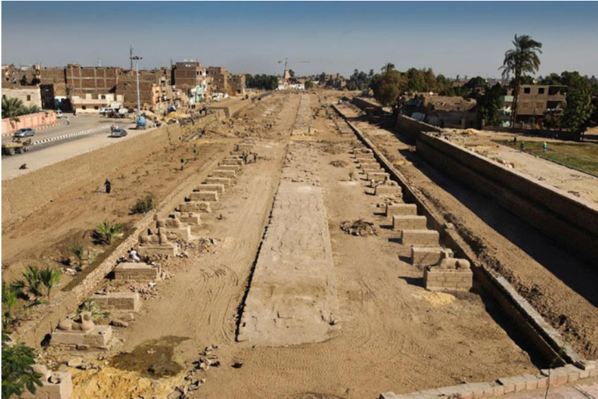
Fig. 17 Sector V after excavations

seems also that the area to the east of the site was for vineyards. The wine installation Among the many important remains of the Roman period structures that have come to light in this portion is the wine factory. It is located to the West of the western row, behind the sphinxes No. 21–24 and consisting of three main elements: