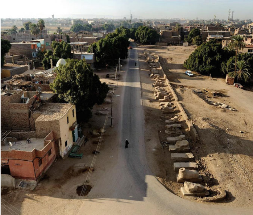
Fig. 21 The old retaining wall

were badly damaged and had completely lost their inscriptions. Along with the sphinxes, remains of tree pits and irrigation pipes of ribbed ceramic were unearthed. On this site as also in the previously described sectors I and IV the sphinxes are placed on an average distance of 6.60 m from the edge of the paved way (in sector II the pavement was missing). In sector V the western row of the sphinxes had been built over by private houses, two mosques, and an asphalt road in front. Our excavations in this sector started in January 2010. We discovered 28 new sphinxes on the western and 7 on the eastern row (Fig. 18). Together with earlier findings by M. El Saghier, a total of 168 sphinxes were excavated in this area. The stone pavement was found in a good state of preservation but erosion is particularly visible on the upper and middle part on its surface. It is assumed that in this section the pavement experienced long periods under Nile water. Most likely, this area was like a lagoon before the construction of the High Dam at Aswan. Our excavations revealed that the avenue extends 320 m to the North at the same level. Thereafter, the Avenue of Sphinxes was built in ancient times at a slightly higher (60 cm) level than the parts before. Under the reign of Nectanebo I a ramp was built to connect