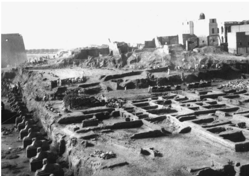
Fig. 2 Abdul-Razeq excavations

Inscriptions were found running around the bases of the sphinxes recording Nectanebo's titles and epithets. On one he describes " this magnificent avenue which was enclosed within walls, planted with trees, and made dazzling with flowers basins ". Of note, Dr Abdulqader recorded that the eastern row of the sphinxes was, without exception, destroyed, whereas the western row was found intact. Mohamed El-Saghir recorded a similar scenario to the northeast.