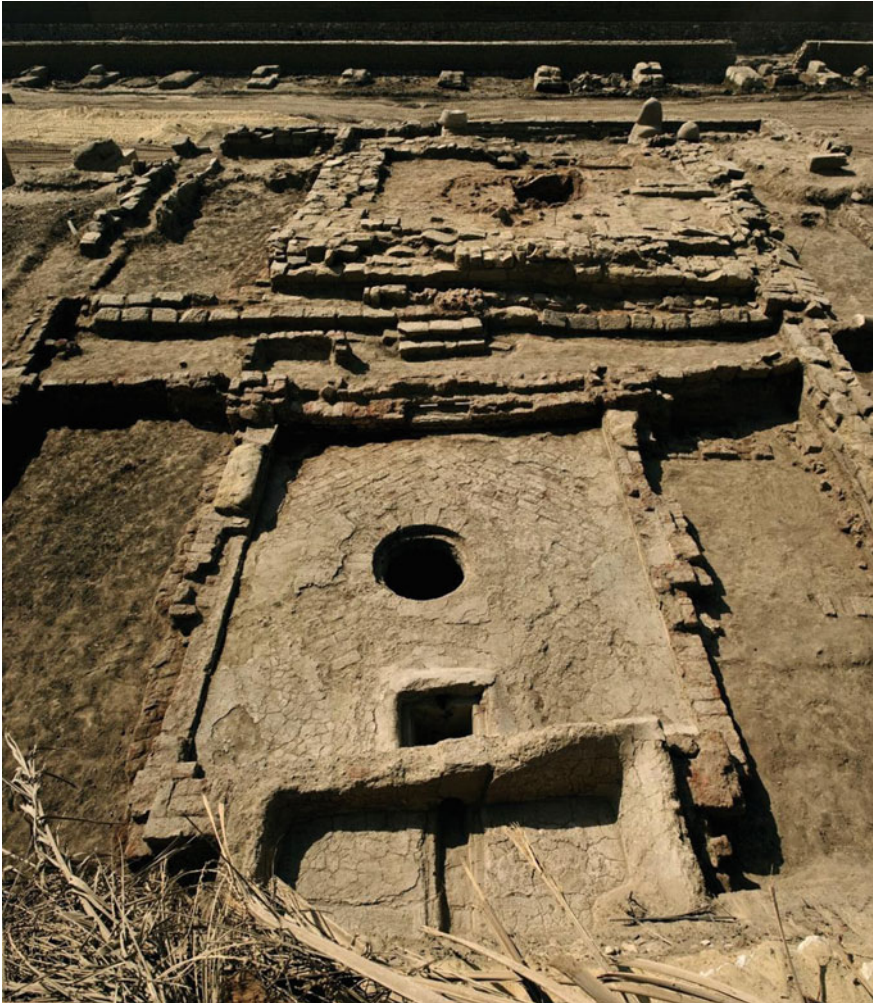
Fig. 15 Cistern

The site is located 750 M to NE of Luxor Temple and is bounded to the NE by Airport road and to the SE by El-mathan street, to the SW by Sharya El-karnak and to the east by Abu al-Goud village. The site extended for 653 m × 76 m wide and is named after Luxor Library; it was occupied by agriculture which didn't effect on the preservation of the avenue and also gave us an idea about the stratigraphy of the