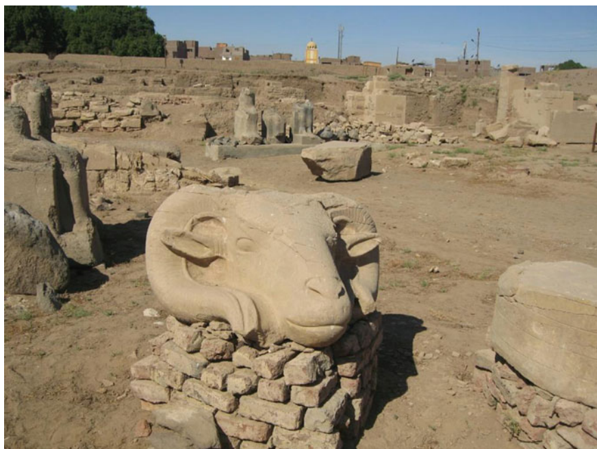
Fig. 9 One of the heads of the ram head sphinxes