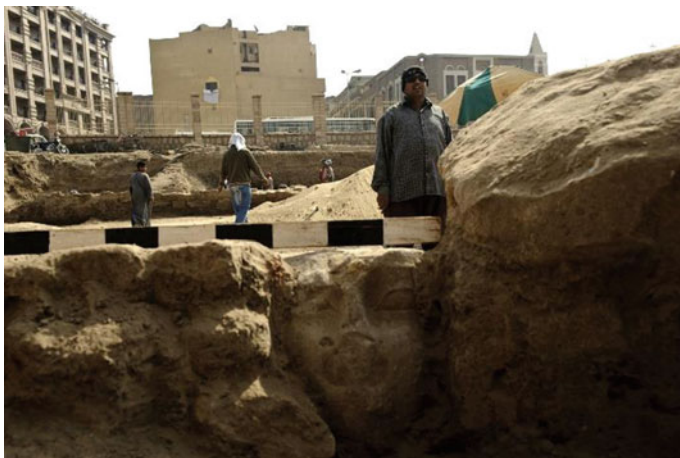
Fig. 6 A head was used as filling during Roman time