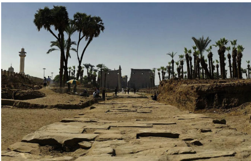
Fig. 4 The excavations in front of Luxor temple