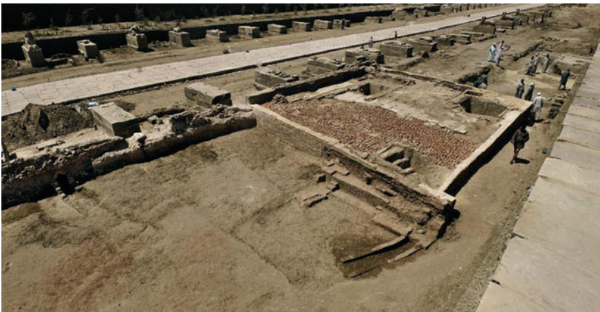
Fig. 16 Wine presses

Two remaining parts of the pavement were uncovered. The first was towards the north, next to the Airport road; the second part is to the South of the first and was damaged by an important flood episode: the slabs are slightly isolated and silts were deposited between. The excavations revealed that this sector was truncated by three factors: First, during the late Roman time, the bodies of the sphinxes were used as bedding in some structures and later this area was turned into an industrial area. Second, at that time a large flood event covered and destroyed part of the site and left behind a thick layer of clayish silt and silty clay raised about 1.2 m above the sphinxes. Third, during the medieval period the sandstone blocks and fragments of the avenue were largely carried away, especially the pedestals. This explains the fact that many sphinxes were thrown off their pedestals. As mentioned above, this sector, was used in the late Roman period for industrial purposes. Wine installations with their related structures as pottery kilns, galleries for labors, were found. It