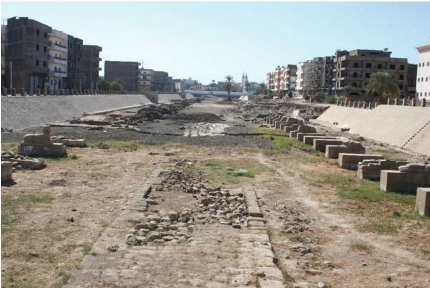
Fig. 22 The embankment of the Sphinx Alley

This construction might have been a type of flagpole holder, made to support wooden beams that were held by ropes and tied to the holes. Perhaps, this platform may have been used to announce the beginning of the Opet festival after the level of the inundation was measured in the well (Fig. 21). Approximately 200 m from the