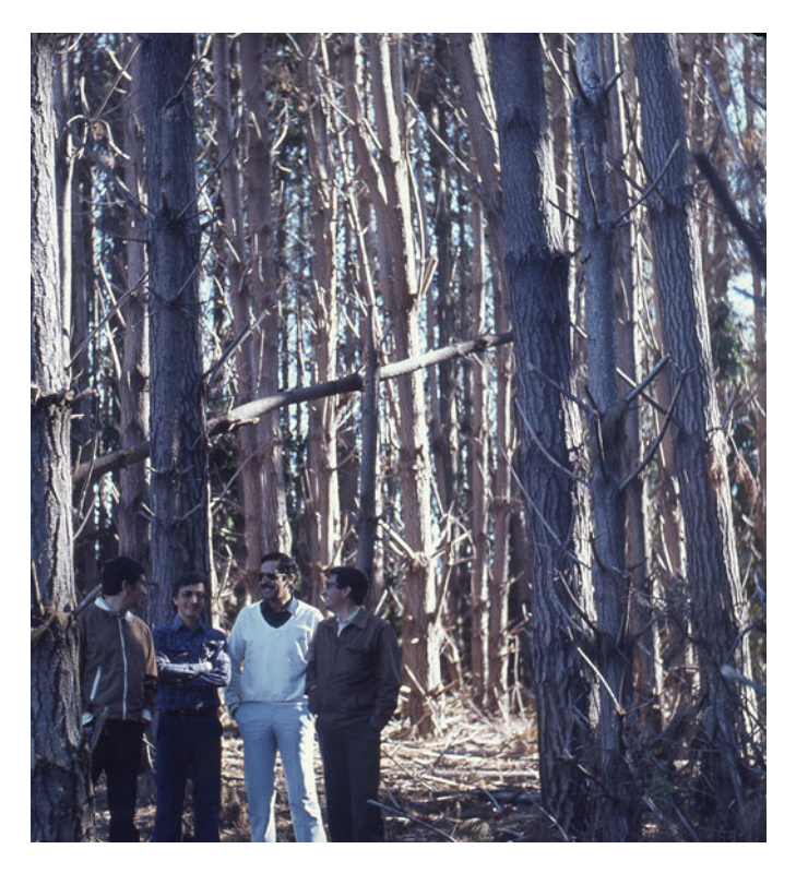
Fig. 5.16 Unthinned radiata stand in Chile, some 20 years old, showing relatively low natural stem mortality characteristic of Chile. Note the contrasting frequencies of branch clusters between the tree in the left centre foreground and one in the far right foreground