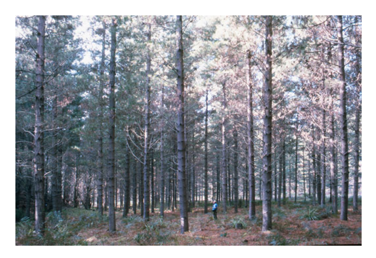
Fig. 5.25 Tasman Forestry Ltd's oldest stand of cuttings, taken from 7-year-old trees, in June 1986, 16 years after planting. The trees feature good bole form and thin bark, reflecting the age of donor trees and choice of donors with "short-internode" branching pattern; and similarity of habit and cones, a consequence of many of the trees belonging to the same clones