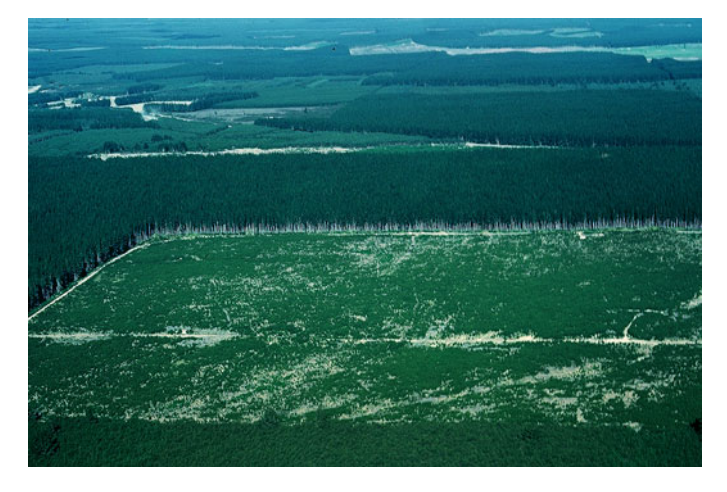
Fig. 5.2 Aerial view of part of Kaingaroa Forest, New Zealand, showing patchiness of natural regeneration of radiata occurring after clearfelling operations. Such natural regeneration is no longer relied upon, and is now discouraged

These problems with natural regeneration of plantations, in which regeneration often was over-dense, too sparse or unacceptably patchy, have occurred in all the countries that are the main growers of radiata as their plantation managers attempted to rely on natural regeneration.