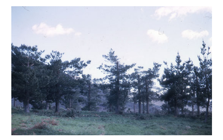
Fig. 5.21 Pollarding trial in Gwavas Seed Orchard, Hawke's Bay, New Zealand. Aimed at preventing grafts becoming unmanageably tall, this practice reduced seed yields unacceptably. Recourse was made to climbing and/or use of hydraulic hoists

The rapid height growth of radiata grafts and cuttings in the seed orchards made managing those parents and collecting their cones difficult (Fig. 5.21). Also, large differences among the parent clones in fecundity, especially in viable conelet production but also in pollen production, were soon evident. This meant that the "effective number" of parent clones producing the wind-pollinated seeds in an