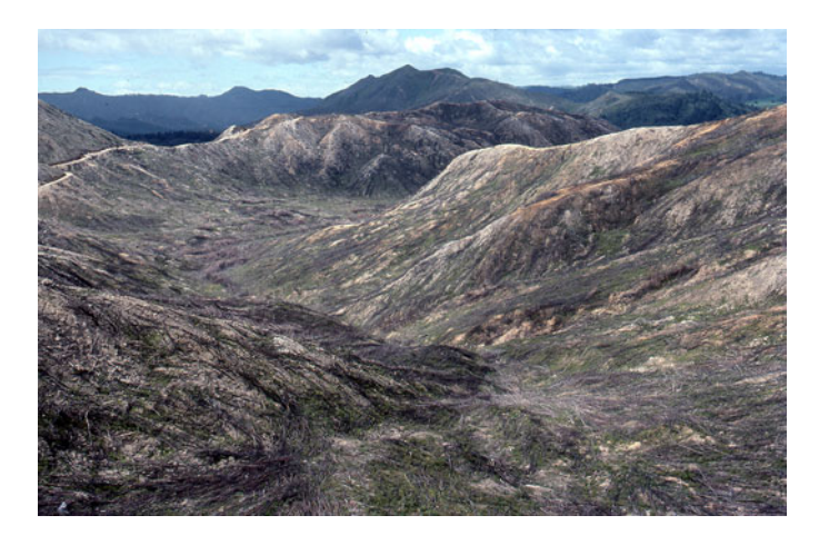
Fig. 5.6 Site preparation for planting achieved by mechanical clearing of existing vegetation, but involving some undesirable scalping of topsoil