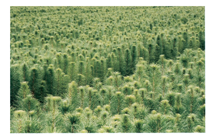
Fig. 5.3 Nursery beds of radiata seedlings, showing green apical tufts of primary (juvenile) needles. With time and increasing height the shoot tips transition into brown, sealed buds

Even so, it is desirable to get the planting stock conditioned, to help assure good survival even in adverse conditions, and good growth from the outset. An important advance achieved from research in New Zealand during this period was repeated undercutting of the roots in the nursery beds, to encourage fibrous multiple-root development and to harden off the tops so the propagules can resist some desiccation shortly after field planting. Such treatment is inclusively termed "wrenching," and begins by undercutting the tap roots of seedlings or sinker roots of cuttings.