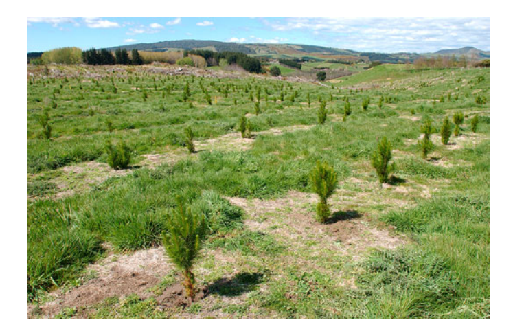
Fig. 5.8 Spot spraying of grass before planting radiata, to avert competition from pasture grasses

required in its establishment phase. Even so, control of competing vegetation is sometimes needed after planting, to give the young trees enough light or to reduce competition for water and nutrients. Being tolerant of various herbicides, radiata in some countries featured in the development of mechanised (often aerial) postplanting applications of herbicides.