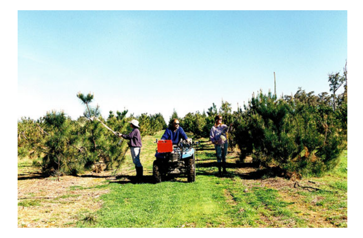
Fig. 5.22 Hedged Artificially Pollinated Seed Orchard (HAPSO) in Western Australia, Pollen being blown onto receptive conelets with the help of an air compressor. Further control of pollination was achieved by spraying maleic hydrazide to suppress pollen catkin growth on recipient ramets

In New Zealand, these problems with managing seed orchards spurred much research at FRI, led by Geoff Sweet on several fronts. Graft incompatibility was researched, helped by Bob Kellison during a year-long sabbatical visit from North Carolina State, trying remedies used for loblolly pine, without achieving any clear solution. However, enhanced initiation of both male and female strobili proved possible with the application of gibberellins, specifically GA 4/7 (Ross et al. 1984). Although the most responsive clones were the ones that already flowered best, thus maintaining or increasing fecundity differences, this became and has remained operational practice. Various crown-shaping regimes were tried, analogous to pruning fruit trees, in order to achieve less expensive controlled pollination and more convenient cone collection (e.g. Sweet and Krugman 1978). The FRI orchard-pruning regimes were subsequently adopted in Western Australia, under the leadership of Trevor Butcher, and modified as HAPSOs (Hedged Artificially Pollinated Seed Orchards; Wu et al. 2007) (Fig. 5.22).