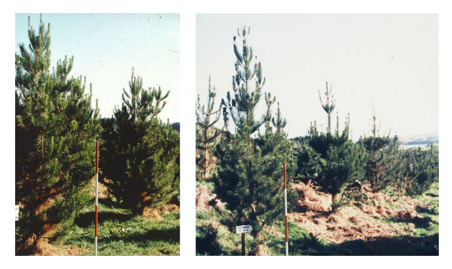
Fig. 5.26 Comparison of seedlings (left) and cuttings taken from 4-year-old trees (right), the latter showing a less bushy, more open crown habit. Ageing of donor trees can improve tree form sooner than it depresses growth rate, but production of cuttings tends to become more expensive as tree form improves

nurseries to become field-ready plantlets, and researching their subsequent growth. Later on, towards 1990, PEG was ready to begin research on somatic embryogenesis, which was aimed at eventually producing field-ready "emblings" and even encapsulated artificial seeds.