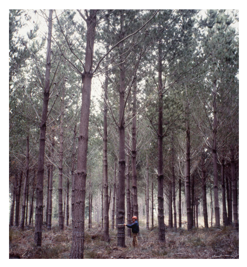
Fig. 5.19 Open pollinated offspring of long-internode radiata trees in a 15-year-old field progeny trial on a New Zealand site of moderate growth rate

first developed as an offshoot of the GF breed although, in the FRI programme, dothistroma resistance later became part of its mainstream breeding goal rather than the basis of a specialized breed. Some selections for dothistroma resistance, imported from Kenya, did prove to have superior resistance, but had not been selected for bole form and were therefore not integrated into the FRI breeding programme.