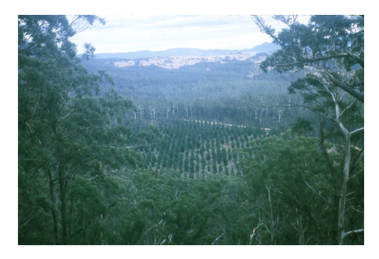
Fig. 5.23 View of Tallaganda Seed Orchard, in NSW near Canberra in an isolated montane location surrounded by eucalypt forests. Such sites were used for a number of seed orchards in NSW, ACT and Victoria, but seed yields were poor or modest compared with those on more maritime sites (Pederick and Brown 1976)

Ironically, the findings of much good and painstaking research were overridden by the realization that correct choice of orchard site could avoid several of the main seed-orchard problems. The early preoccupation with pollen isolation (Fig. 5.23) often led to choosing inherently unsuitable sites for seed production, without always achieving effective isolation. The present-day ideal for a New Zealand radiata seed orchard is a sunny, largely frost-free site, with modest but sufficient rainfall and good drainage, located close to the sea. This important latter