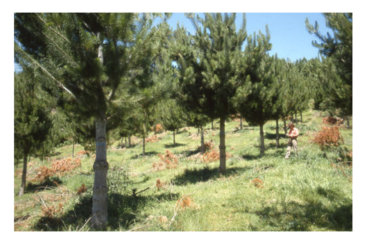
Fig. 5.14 Early stage of agroforestry trial with radiata, established in pasture with the idea that pasture could provide an intermediate yield in lieu of thinnings, prior to canopy closure

Major impetus for agroforestry research in New Zealand undoubtedly stemmed from a personal friendship between Bunn and Barr. Within FRI and with Bunn's blessing and support, Leith Knowles led early research efforts on the agroforestry option (Fig. 5.14), joined by personnel from the Ministry/Department of Agriculture. In the following three decades, Knowles made the results of that research broadly available, and joined Barr in strongly advocating the apparent advantages of agroforestry. The availability of genetically improved radiata with