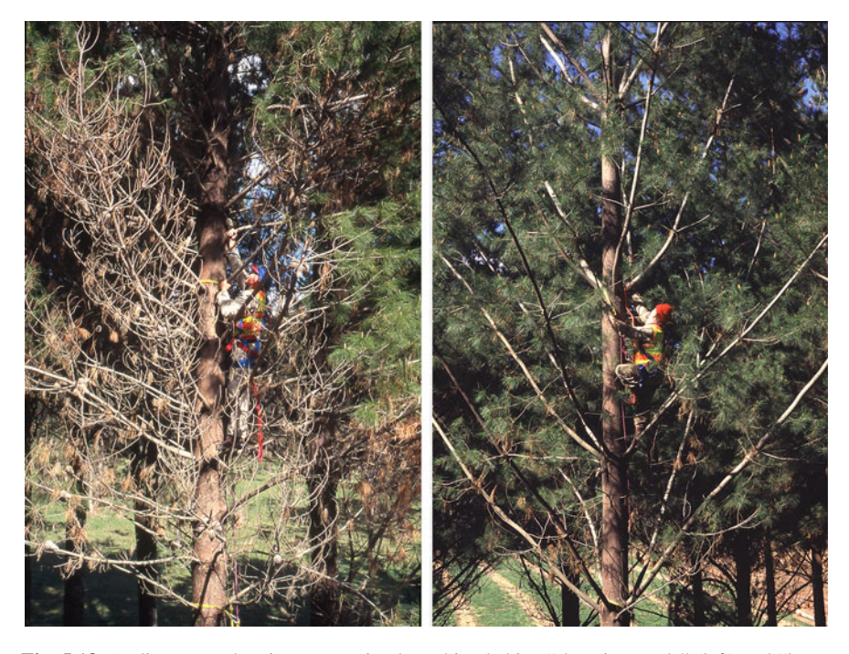
Fig. 5.18 Radiata trees showing contrasting branching habits: "short-internode" (left) and "longinternode" (right). The former was pursued automatically in the mainstream breeding programme in New Zealand, despite giving only short lengths of clear timber between knot clusters, while the latter was pursued in a side programme to provide good lengths of clear timber without pruning, despite disadvantages in early growth and tree form

general health. Of the 140 such selections, 104 were selected in 1970 in northern Kaingaroa Forest, in the same general areas where the 1968 plus-tree selections favouring short-internode trees had been made. Fewer long-internode than short-internode plus trees could be found per unit area because of a combination of two factors: trees of the appropriate branching pattern were less common, and among them fewer had both high vigour and superior bole form. The remaining 37 such selections came from individual long-internode offspring within controlled crosses among plus trees selected in the 1950s. The long-internode selections and their offspring came to be recognized as a Long Internode (LI) breed , with a differentiated breeding goal that was primarily defined by the long-internode trait (Figs. 5.18 and 5.19). Clonal archives of these LI plus trees, and an LI seed-orchard and LI progeny tests were established. Strangely, no demand for seed from that orchard ever materialised.