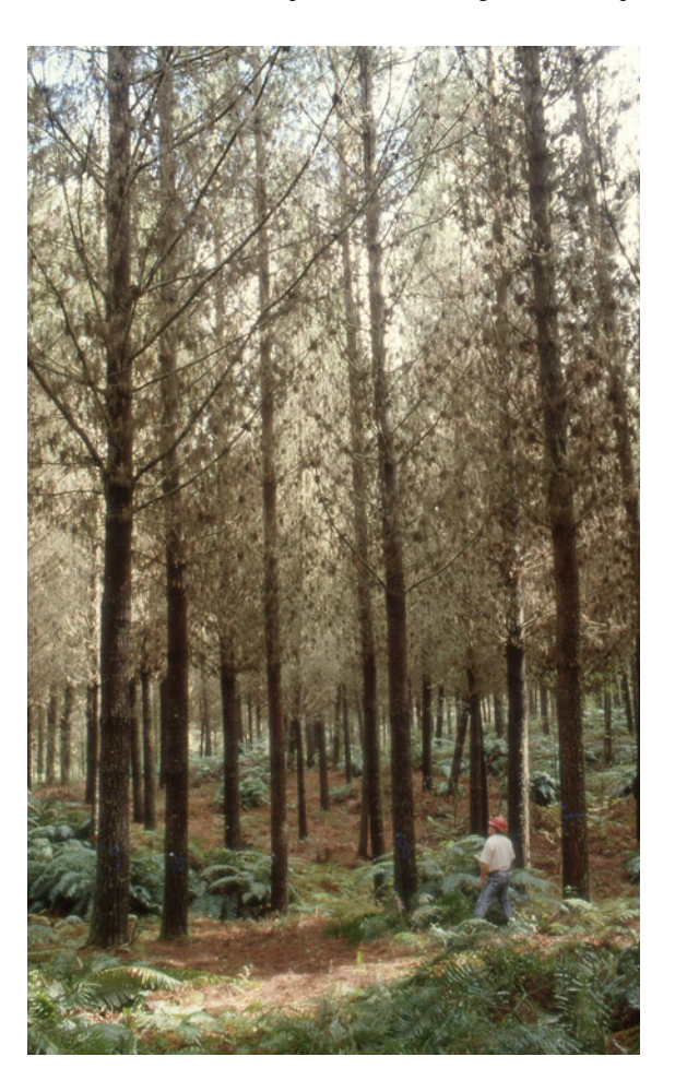
Fig. 5.12 Tree stocking trial with the Direct Sawlog regime, all thinning done without waiting until thinnings were worth harvesting

provide an early financial yield in place of commercial thinnings. Where radiata was the tree species of choice, it was important that the young radiata pines proved to not be seriously vulnerable to damage by grazing stock. Furthermore, ex-pasture sites often gave very rapid tree growth because of the enhanced soil fertility that resulted from relatively intensive pastoral farming.