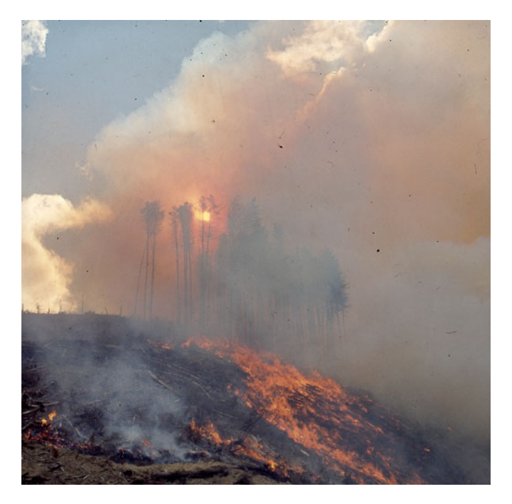
Fig 5.7 Site preparation using a controlled burnoff of logging debris. While producing a clean site, often reducing frost hazard by improving cold-air drainage, this practice has been widely abandoned. On some soils it causes site deterioration, and it is always objectionable to the public. An alternative for controlling weed growth is use of desiccant sprays