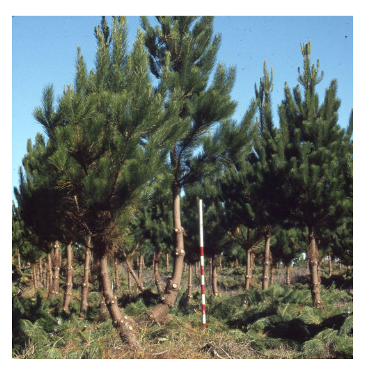
Fig. 5.5 Result of post-planting tree toppling, showing persistent butt deformation that greatly reduces tree value. Toppling can result from any or all of poor practice in the nursery, poor planting, soft and sticky soils and failure to consolidate cultivated soil