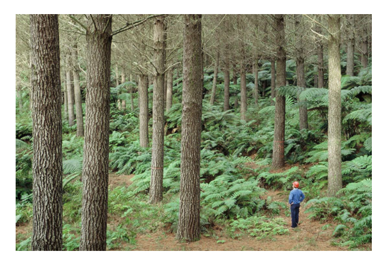
Fig. 5.13 Stand grown under Direct Sawlog regime ready for harvest; early thinning to low final-crop stocking was accompanied by pruning