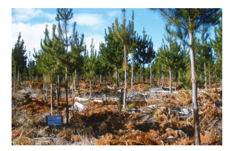
Fig. 5.11 Early trial tending natural regeneration in Kaingaroa Forest, New Zealand, showing heavy early thinning and low pruning

Brown was a forester responsible for areas in the far south of New Zealand where young plantations were at ages when decisions had to be made about their tending. He was well-acquainted with problems of trying to thin relatively old, over-crowded stands of radiata. Later on, he also noted the disastrously poor grades of sawn timber from a Corsican pine stand that had been thinned heavily to allow the crop trees free growth, but the resulting large lower logs had received only very belated pruning. In 1956 he therefore decided to focus thinning efforts on his young stands, and he realised he needed to address the questions of when and how to prune. In taking the initiative, he was even prepared to physically do experimental tending himself. In tackling the younger stands, thinning heavily and doing first pruning before age 10, his aim was to keep the "knotty core" of logs small so the butt logs would contain a thick outer zone of clearwood.