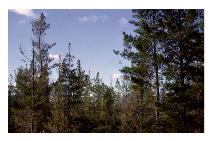
Fig. 5.10 Response of radiata to phosphatic fertliser on strongly P-deficient site. The tree on the left is severely deficient; on right this deficiency has been corrected

phosphate-poor sites in New South Wales, the ACT and parts of South Australia (e.g. Boardman 1988; Horne 1988). That input, together with weed control, was sometimes sufficient to make radiata an economic crop on sites otherwise regarded as unsuitable for the species (Boardman 1988). Understanding of the interactions of fertilizer application with weed management, with thinning and with stand age led to