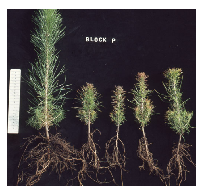
Fig. 5.9 Five nursery seedlings showing zinc deficiency compared with one with deficiency corrected by spraying with zinc sulphate