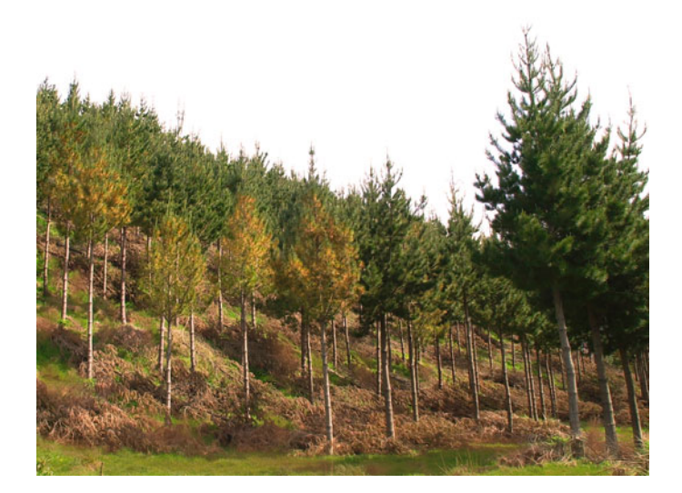
Fig. 5.17 Cyclaneusma needle cast affecting several trees in the left foreground in a young radiata stand near Rotorua, New Zealand. This condition can severely affect growth rate, and resistance is now routinely sought in selection in New Zealand

Further controlled crosses were made around 1980, choosing parents on the basis of accumulated progeny-test information. Those crosses involved several series of select parents, and progeny trials were duly established.