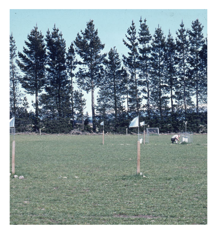
Fig. 5.15 Sophisticated shelterbelt grown on Canterbury Plains, New Zealand, by P. Smail, a prominent farm forester. The large trees are radiata, alternate trees being pruned for producing clear timber and left unpruned for providing continuous shelter. The smaller trees are deodar cedar, to give longer-term shelter from the ground upwards

Roughly paralleling refinements in establishing agroforestry blocks came refinements in the treatment of radiata shelterbelts to produce high-quality timber. Historically, shelterbelts had often been grown for producing firewood as well as providing shelter. This had often entailed periodic topping to control shelterbelt height, which also better maintained continuity of shelter and made the trees resistant to windthrow. Where the trees had not been topped they could produce respectable sawlogs. As radiata became increasingly accepted as a sawtimber, farmers became increasingly interested in producing quality butt logs material in shelterbelts. This led to a profusion of designs and management regimes for shelterbelts (Maclaren 1993; Mead 2013) (Fig. 5.15). For instance, some of the trees could be pruned for clearwood production, while intervening trees could be trimmed to produce continuing low shelter below pruning height; alternatively, the intervening trees were often of other, slower-growing species.