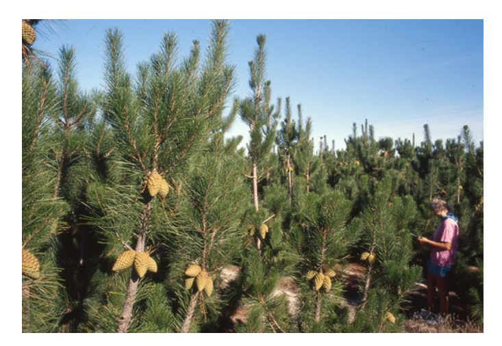
Fig. 5.1 Accumulation of ripe, unopened cones on a radiata graft within a hedged seed orchard

most pine species from pollination to availability of fully-ripened seeds, a drawback compared to the less-than-a-year delay in such species as redwood and Douglas-fir. Indeed, keeping that delay to only two years for radiata can depend on "curing" still-green cones picked early in order to accelerate ripening but retain full viability of its seeds (Rimbawanto et al. 1988).