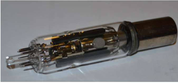
Fig. 3 Experimental sample of X-ray source