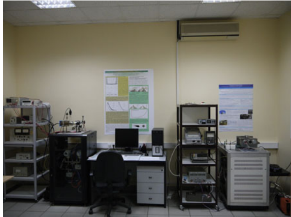
Fig. 4 Stands for the experimental research: Left part of the photo is for X-ray source, Right part of the photo is for Cathode

consumption is 2.77 W, the cathode current is 74.80 \mu\text{A} , the sample dimensions is of 65 mm \times 22 mm, the focal spot size is 439 \mu\text{m} , and the cathode current is about 75.2 \mu\text{A} after exposure to high and low temperatures.