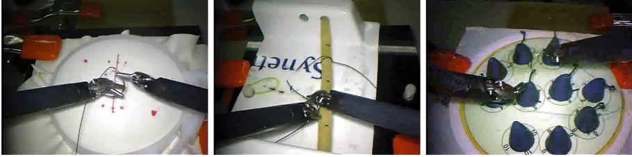
Fig. 2. Snapshots of the three surgical tasks in the JIGSAWS dataset (from left to right): suturing, knot-tying, needle-passing [7].

In order to classify an unlabeled kinematic data, the method transforms it into a terms frequency vector using exactly the same sliding window and SAX parameters used for the training part. It computes the cosine similarity measure (Eq. 4) between this term frequency vector and the N tf*idf weight vectors representing the training classes. The unlabeled kinematic data is assigned to the class whose vector yields the maximal cosine similarity value.