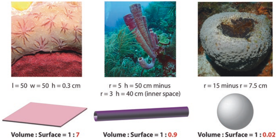
Fig. 8.1 Volume-to-surface area ratio of a thin encrusting sheet-shaped sponge Halisarca caerulea , a massive tubular sponge Aplysina archeri , and a massive ball-shaped sponge Ircinia strobilina . Shown are their representative geometrical forms ( thin cuboid , hollow cylinder , and dented ball ) and volume-to-surface area ratio based on hypothetical (but representative) sponge sizes. l length, w width, h height, r radius (all in cm)