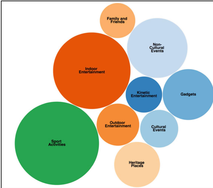
Fig. 3. Using bubble charts for analyzing perception data