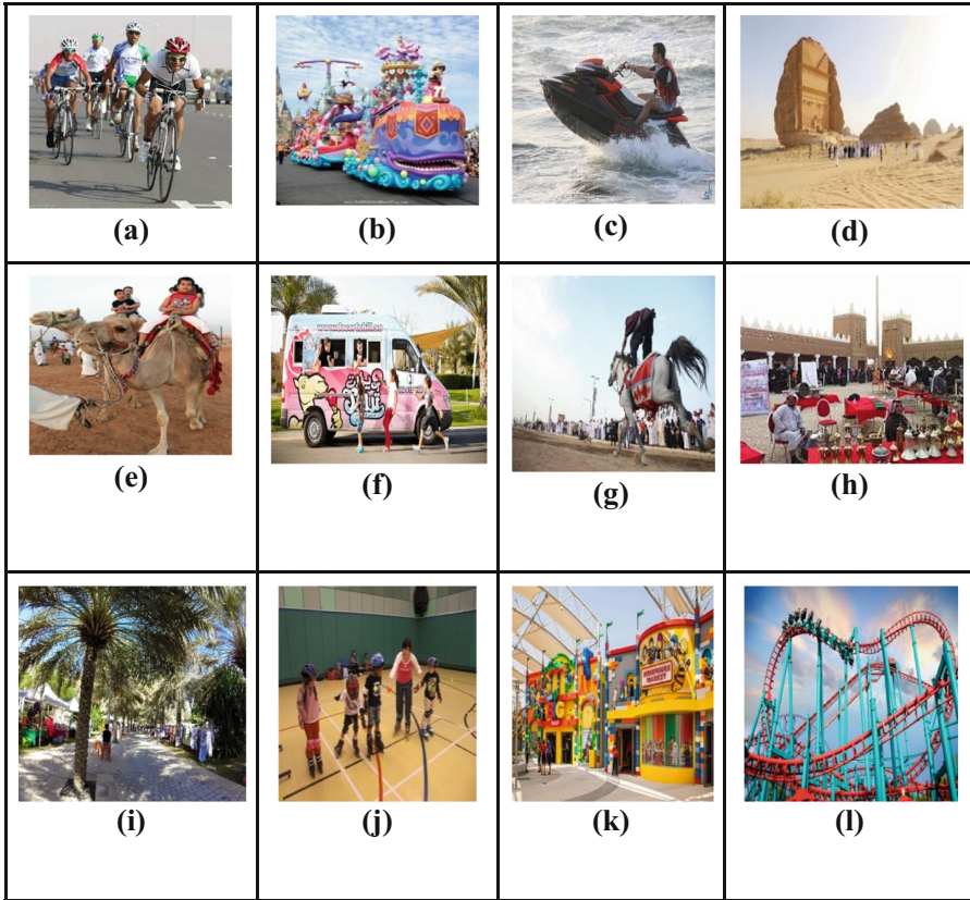
Table 1. Sample of the images included in the dataset

options (e.g., parks, resorts and beaches), sports activities and special cultural and social events. We also placed labels indicating if the entertainment method depicted in the image is electronic (e.g., video games) or kinetic.