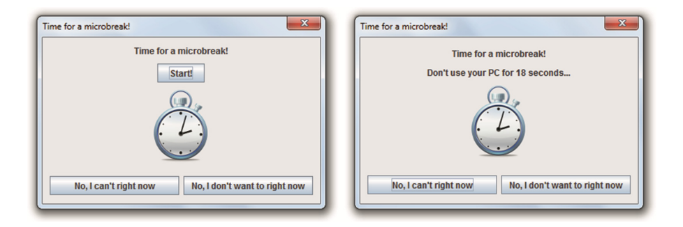
Fig. 2. The BabylonB pop-up in its initial state, as it was displayed to the participants (left) and in its state as after clicking the "Start" button (right).

Each hour (but not within 3 min of the previous trigger) the application would present a pop-up window on the participant's screen with a trigger message to take a break (see Fig. 2). This pop-up window presented the text message "Time for a microbreak!" Participants click a button to accept (clicking a button labelled "Start!") or refuse this suggestion (clicking a button labelled "No, I can't right now", or a button labelled "No, I don't want right now"). If a participant clicked the button "Start!", That button disappeared and timer (counting down from 30 s) was shown in its place. This short break duration is the same as used by [28, 29].