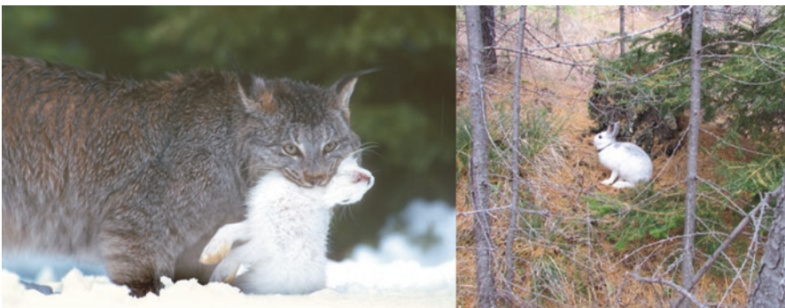
Fig. 8.2 Canada lynx diet is dominated by snowshoe hare, which undergoes seasonal pelage change from brown to white. The effectiveness of this strategy depends on synchrony with snow cover

Ectotherms (cold-blooded animals), which include fish, reptiles, and amphibians, react not by feeling cold and metabolizing energy to maintain core temperature, but by having their metabolism slow until their activity is reduced, in some cases becoming torpid. These basic metabolic differences in vertebrates must be considered in how climate change will interact with animal life history, spatial distribution, habitat quality, and food sources.