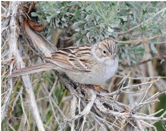
Fig. 8.5 Sagebrush-obligate species such as Brewer's sparrow (shown here) may have less nesting habitat in the future if the extent of mature sagebrush habitat is reduced by wildfire

Brewer's sparrow is a sagebrush obligate during the nesting period, preferring tall, dense stands of sagebrush (Fig. 8.5). In many areas, Brewer's sparrows are the most abundant bird species (Norvell et al. 2014). The obligate relationship of Brewer's sparrow with sagebrush lacks causal explanations (Petersen and Best 1985). Therefore, correlative associations can be used to project climate change effects, but