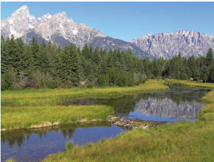
Fig. 8.3 Restoration of American beaver populations helps maintain cool water in mountain landscapes. Beavers create structures that help ameliorate the effects of climate change on habitat for cold-water fish species and other aquatic organisms

Climate can indirectly influence beavers through effects on vegetation. Climate change and climate-driven changes in streamflow may reduce early-seral tree