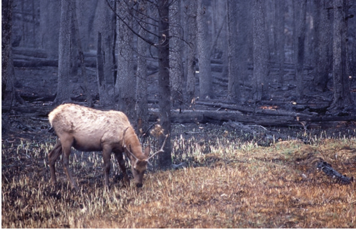
Fig. 8.4 Ungulates generally respond positively to wildfires that create patchy habitat with improved forage, as shown in this photo of an elk browsing in a recently burned lodgepole pine forest

during winter, although in warmer climates, thermal cover reduces daytime heating.