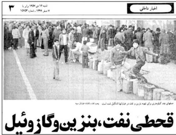
Picture 1 Iranians queuing for fuel in Tehran. The small print Persian text reads: “Queues that are few kilometres long emerged in the streets for gasoline and kerosene. Bagh-e Shah gas station, Sepah Street.” The large print states: “Shortage of kerosene, gasoline, and diesel.”