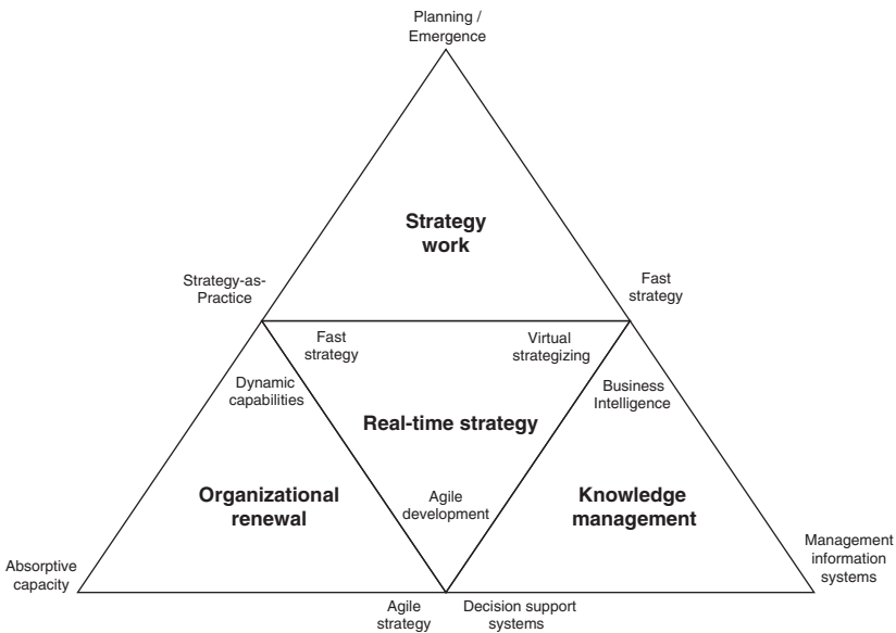
Fig. 1 Real-time strategy building on established concepts

Thirdly, this paper builds on knowledge management, which we define here through management information systems, DSSs, and business intelligence. While we acknowledge the role of BI technologies in the knowledge management process, the main focus here is on the interplay between strategic practices and BI technologies. Figure 1 synthesizes the theoretical concepts utilized in this article.