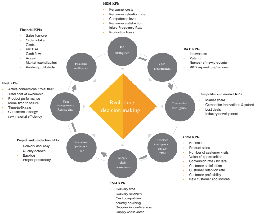
Fig. 3 Business intelligence framework

management team and at a middle-management level. Reflecting the core functions in a technology company, the framework provides measures for different dimensions, such as finance, customer relationship management (CRM), competitive intelligence (CI), R&D, production systems, supply chain management (SCM), human resource management (HRM), and fleet management. The figure uses the dimensions to provide an overview of the scope of decision making, and the applied measures, suggesting that these measures could be used for target setting, follow-up on strategic initiatives and implementation of investments, and setting reward policies by the management team. The framework presented can serve as a tool for real-time strategic management. Each dimension in the figure integrates some main measures used by the case companies studied when developing these frameworks.