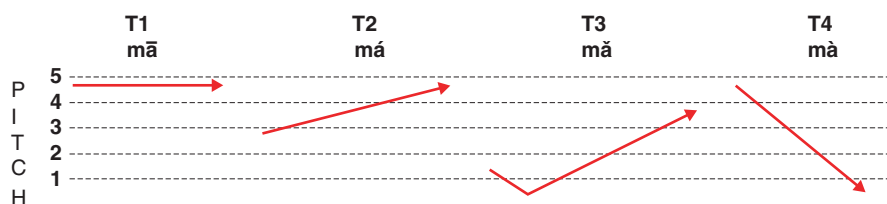
Fig. 2 Graphical representation of the four tones

They may be represented graphically, as in the following figure, where they are exemplified by the four different words mā (mother 妈), má (numb 麻), mǎ (horse 马) and mà (scold 骂) (Fig. 2).