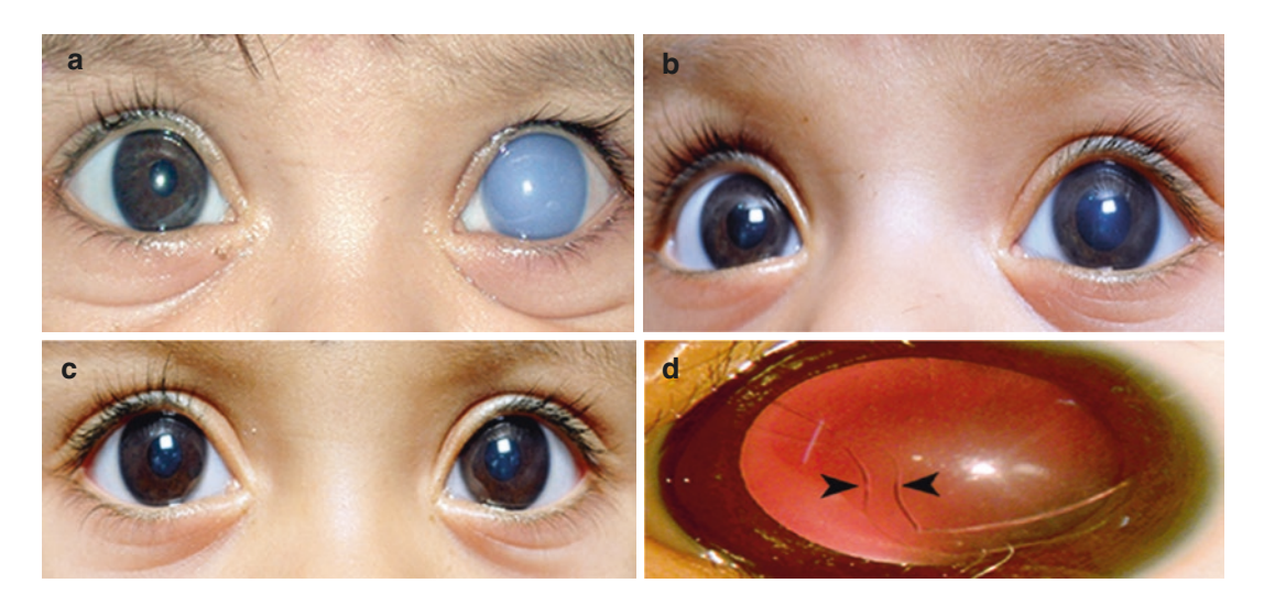
Fig. 11.2 (a) Preoperative appearance of the left eye in a 3-month-old child with primary congenital glaucoma who presented with acute corneal hydrops. (b) Two-week post-operative appearance of the left eye showing dramatic

The argument in favor of primary CTT in some ethnic populations is the higher incidence of successful IOP control with a single operative procedure, as has been reported from India and the Middle East (Fig 11.2) [42, 49, 52]. In the largest Indian series of 624 eyes of 360 consecu-