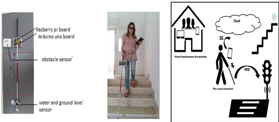
Fig. 2. Use case

The embedded board (RaspberryPi card) of the cane contains a GPS receiver. If the visually impaired person is lost, family members, who have the permission, will be able to find out his location through a mobile application. Finally, in case of cane loss, the owner can use an implemented Smartphone application to detect its location.