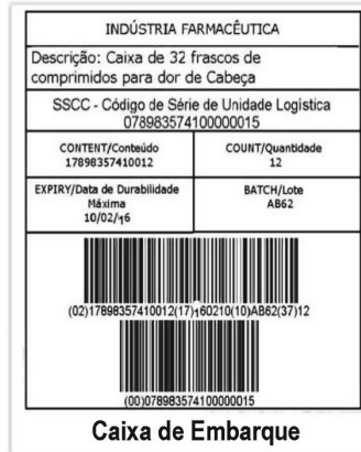
Fig. 2. Label aggregation (Source: [8])

The TBR n°. 54 of 2013 does not have a mandatory requirement regarding the aggregation of shipping boxes on the pallet, however, to be effective control and traceability during all stages of the process is required data to be stored and sent to the server traceability of the manufacturer and stored in a database for later to take effect the transmission of information to ANVISA where there will also be storage in a database.