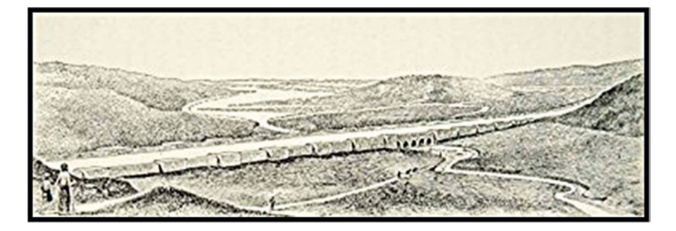
Fig. 12 Sennacherib's Acqueduct in Jerwan.

water sources. Smaller cities survived if they had many springs, wells, aqueducts or cisterns (Fig. 12).