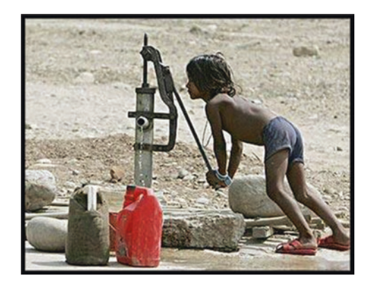
Fig. 1 The bleak future for water. http://im.rediff. com/money/2009/ dec/11water1.jpg

Religions retain a much needed sense of mystery about life and nature as also the capacity to animate people's minds and hearts towards acting with a great sense of responsibility. Christianity is one such religion.