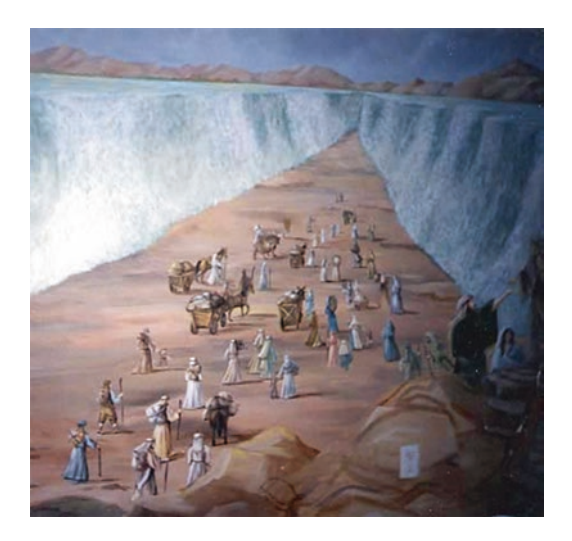
Fig. 3 Parting of the Red Sea. https://www.google.co.in/imgres?imgurl=https://i.ytimg.com/vi/ YnQxDjAVtJ8/hqdefault.jpg%3Fcustom%3Dtrue%26w%3D120%26h%3D90%26jpg444%3Dtr ue%26jpgq%3D90%26sp%3D68%26sigh%3DG9nIAKHoA2a4KIUzEgmrq8iMfAk&imgrefurl =https://www.youtube.com/watch?v=mMOlfUo3JVY&h=90&w=120&tbnid=6h903mp6Dx76p M&tbnh=72&tbnw=96&usg=__bo3iAXcWvOv1bMIgKzScEn1qP-g=&hl=en-IN&docid=ISbFOuw-GJ-lvM

God is attributed with goodness because he gives rain and water. Eliphaz a friend of Job<sup>7</sup> declares God must be good and just because (Fig. 3):