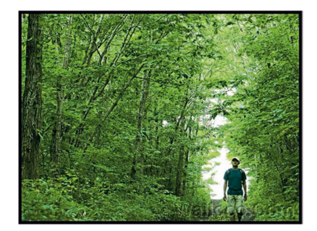
Fig. 18 Humans should live in harmony with nature. http://kamkankouken.jp/tourism/ common/img/activity_list/ masyu_wk.jpg

Social ecology is distinguished from shallow environmentalism that blames the ecological crisis on inappropriate technology, overpopulation or industrial growth,