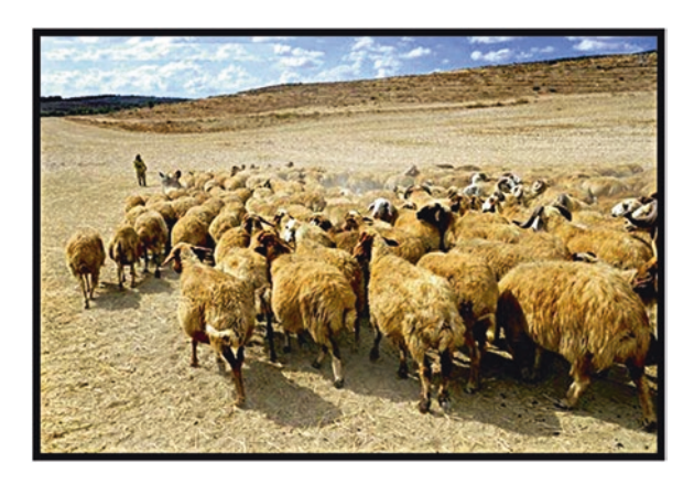
Fig. 15 Semi-nomadic people and their flocks fought over water. http://blog.joins.com/usr/a/la/ alamin/1210/508a212e6eb0a.jpg