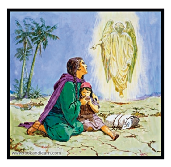
Fig. 4 Angel makes covenant with Hagar at a spring of water.

The Lord makes a covenant with Hagar.<sup>12</sup> The Angel of the LORD found her by a spring of water in the wilderness, the spring on the way to Shur... The angel of the LORD also said to her, 'I will surely multiply your offspring so that they cannot be numbered for multitude... Behold, you are pregnant and shall bear a son. You shall call his name Ishmael, because the LORD has listened to your affliction. He shall be a wild donkey of a man, his hand against everyone and everyone's hand against him, and he shall dwell over against all his kinsmen'. Genesis 16:7