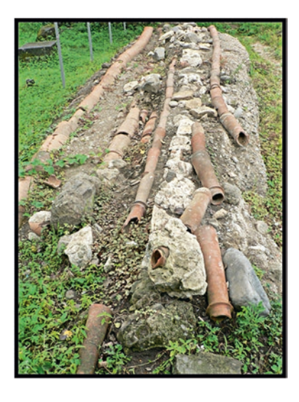
Fig. 14 Roman water pipes.

Both wells and cisterns were used as sources of water. Cisterns were made double or triple to allow sediment to settle down keeping water pure. The distribution