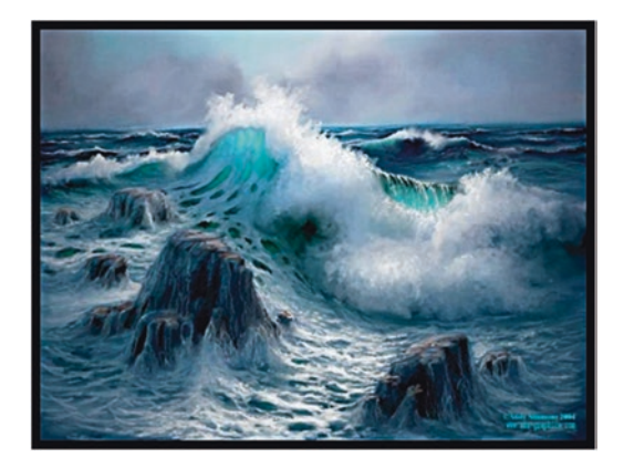
Fig. 5 God keeps mighty waters under control. https://sameapk.com/ ocean-wave-wallpaper/

the diseases upon you which I put upon the Egyptians, for I am the LORD, your healer'. Exodus 15:26