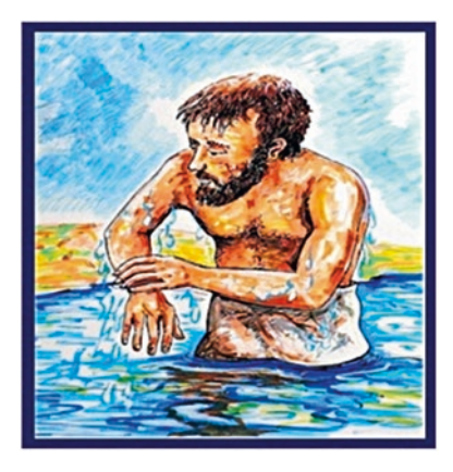
Fig. 7 Naaman healed of leprosy. http:// pearlsofpromiseministries. com/wp-content/ uploads/2015/01/ naaman-the-leper-washinghimself-in-the-jordan-x7times.jpg

In the New Testament, Jesus sends a man born blind to the pool of Siloam to wash himself to be healed of his blindness. The blind man returns healed. John 9.1- 7. The pool of Bethesda in Jerusalem was considered to acquire healing powers whenever an angel entered it and stirred up the waters. A multitude of sick people, blind, lame and paralyzed would wait for their turn to enter the waters first to be healed at such times. John 5.1-4 (Fig. 8).