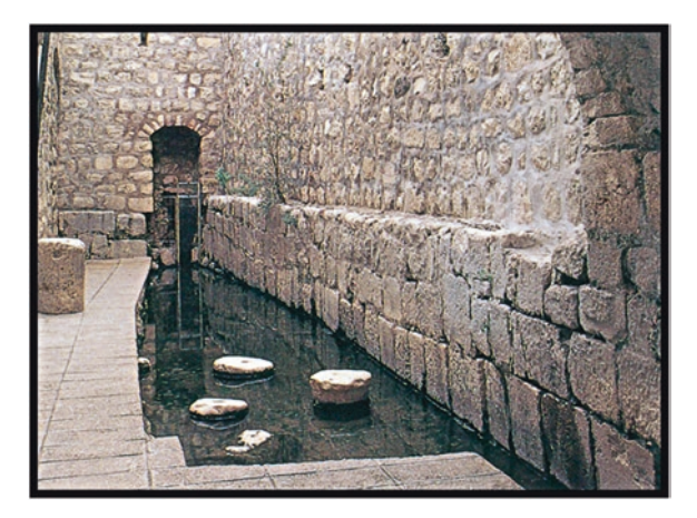
Fig. 8 The pool of Siloam. http://1.bp.blogspot.com/-AfjZKMZoONY/UmKSL7ZbL9I/AAAAAAAA BIQ/6N8IIvZzHkQ/s1600/pool+of+siloam.JPG