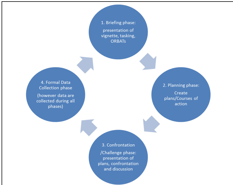
Fig. 1. CDAG four phase process [3]

Both Assessment Games use vignettes within an overall military scenario. DTAG is used to assess the impact of technology on recognizable situations and CDAG is a qualitative analytical method for assessing concepts or conceptual documents. It can be used at various stages in the concept development process. During DTAG potential technologies or focus areas are identified, which are intended for the generation of Idea of Systems (IoS) cards. An IoS card is a card with the description of a potential new