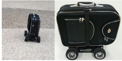
Fig. 1. aBag: front and side views.

doing other things. It is plausible to envisage several scenarios in which such an assistive robot would be extremely helpful, specially for elderly people. Recently, the NUA company announced the development of a robot, the NUA Robotic Luggage [7], designed to perform the same task as aBag. From what is available, it seems that this robotic suitcase is an autonomous version of aBag. Thus, the questions we pose in this work and the study performed become even more relevant and opportune.