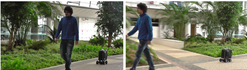
Fig. 3. Participant using aBag as his own robotic suitcase.

The fact that aBag was acting in different ways for the two interactions was not explicitly explained to the participants. The 7 participants that could not perform the whole experiment stopped the procedure at step (iv). 1