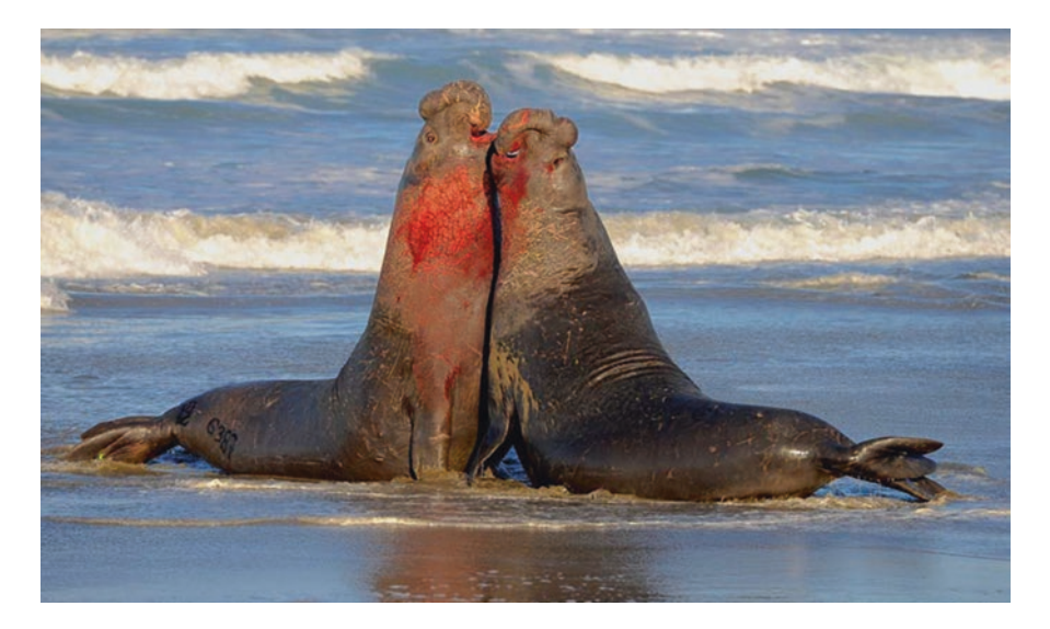
Fig. 16.4 Two male Northern elephant seals ( Mirounga angustirostris ) fighting, a behaviour which is often linked to high rates of morbidity and mortality.

Interspecific aggression which leads to injuries is a prominent and common wild behaviour (Bartholomew 1970; Chilvers et al. 2005; Wartzok 1991) and in terms of captive animal welfare represents an interesting dilemma in so far that it warrants the question whether wild welfare states are the sole sought-after standard. Pinnipeds species are generally sexually dimorphic and some of the most polygynous of all animals (Riedman 1990): males fight during and around breeding seasons, subadult males practice fighting and mating skills and females defend their resources and pups, and as a result interspecific injuries are common, often debilitating, and sometimes fatal (Fig. 16.4). For example, 84% of females had permanent interspecific-injury scars in a New Zealand sea lion population ( Phocarctos hookeri ), 0.5% of the