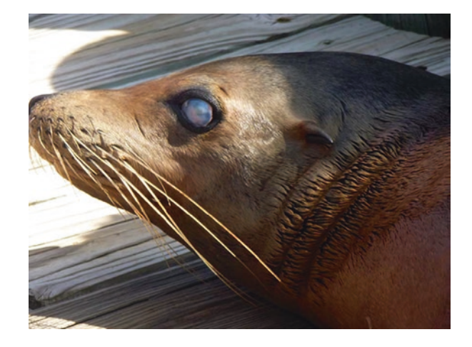
Fig. 16.3 Cataracts and lens luxation are commonly seen in pinnipeds in captivity: the photo shows a severe case in a California sea lion ( Zalophus californianus ).

Eye pathologies in captive pinnipeds are common and have been attributed to pool design and water quality (Colitz et al. 2010; Gage 2011) (Fig. 16.3). Although cataracts and lens luxation are common age-related diseases in humans and other animals, additional risk factors for their incidence in captive pinnipeds were identified by Colitz et al. (2010). These risk factors include insufficient access to shade, a history of fighting and previous ocular disease. Access to shade (or deep water) is likely a crucial resource-based measure of welfare for pinnipeds and is stipulated in the AWA (1966), but could be more conservative, i.e. more rigorous, as proposed by Clegg et al. (2015) for dolphins. Although pool colour was not reported to be a significant factor in Colitz et al.'s (2010) study, the authors nevertheless suggest that colour should be considered for inclusion in welfare assessments. Individual clinical measures of eye disease could follow the standardised method suggested by Clegg et al. (2015) in which a photographic scale (reference scale) is used (see Chap. 12). Photographic reference scales of eye opacity and squinting in pinnipeds