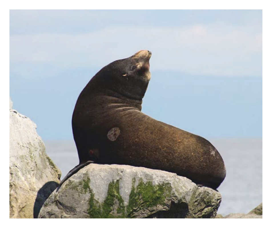
Fig. 16.2 Photo showing chosen resting position of a wild Steller sea lion ( Eumetopias jubata ): published data and observations of wild pinniped behaviour will aid in understanding of 'normal' behaviours in captivity.

behaviour, due to the (generally) less complex social systems seen in pinnipeds when compared to, for example, cetaceans (Schusterman et al. 2002). Using knowledge of other species' welfare and indications from published pinniped research, some 'pilot' behavioural measures can be suggested: