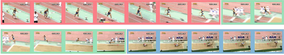
Fig. 1. The action “jump” can be roughly parsed into three divisions: running approach, body stay flew in the air and touch down. Each division can also be parsed into different sub-divisions

coding of these local descriptors. As a result, the temporal dependencies and dynamics of the video are seriously neglected.