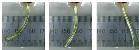
Fig. 3 Electrical actuation of biodegradable gelatine. Frames 4s apart

It has recently been shown that soft robotics is particularly suited to the development of biodegradable and decomposing robots [16]. Conventional rigid and electromechanical robots all face limitations with respect to their decomposition, due to complex component integration, and their degradation, due to the prevalence of non-biodegradable materials. In contrast, biodegradable soft robots can be fabricated from naturally occurring biopolymers such as agar, natural rubber [17] and gelatine/collagen [18]. These materials have been shown to act as electroactive polymer actuators (Fig. 3) and can therefore form the compliant body and ‘artificial muscles’ of a soft robotic organism. Combined with MFCs, they constitute the fundamental blueprint of a wide range of soft robots that live by feeding on freely available organic material, die when they come to the end of their life, and safely degrade to nothing in the environment. The materials that make up the robot are consumed by competing organisms with negligible overall impact. It has also been shown that MFCs themselves can be made biodegradable [19, 20]. Such a low environmental impact means that we can also take radically different approaches to robot deployment. Instead of releasing and recovering a small number of non-biodegradable robots which must be recovered at the end of their productive