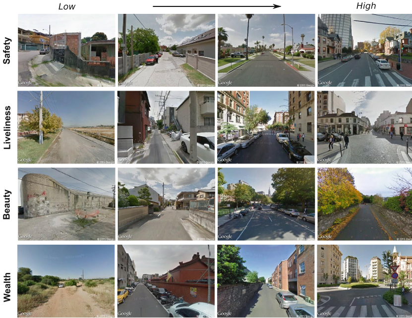
Fig. 3. Example results from the Place Pulse 2.0 dataset, containing images ranked based on pairwise comparisons generated by the RSS-CNN.

obtain stable ranked scores. We use this trick to generate TrueSkill scores for four attributes using pairwise comparisons predicted by a trained RSS-CNN (VGGNet) (30 per image). Figure 3 shows examples from the dataset, and Fig. 4 shows failure cases. We find that, for instance, highway images with forest cover are predicted to be highly safe, and overcast images as highly boring. Quantitatively, the correlation coefficient ( R^2 ) of Safe with Lively , Beautiful , and Wealthy is 0.80, 0.83, and 0.65 respectively. This indicates that there is relatively large orthogonality ( (1 - R^2) ) between attributes. See supplement for details.