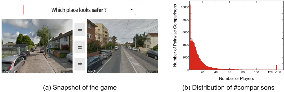
(a) Snapshot of the game