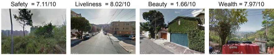
Fig. 4. Example failure cases from the prediction results, containing images and their TrueSkill scores for attributes computed from pairwise comparisons generated by the RSS-CNN.

cities using TrueSkill scores for images computed from 30 “synthetic” pairwise comparisons generated with RSS-CNN (VGGNet). While the prediction performance of the network on these images cannot be quantified due to a lack of human-labeled ground truth, visual inspection shows that the scores assigned to streetscapes conform with visual intuition (see supplement for map visualizations and example images).