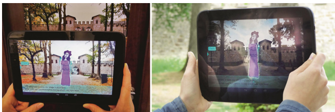
Fig. 2. Mockup UI evaluation indoors (left) and outdoors (right).

For the above-mentioned interactions, the mobile application needs to be equipped with various UI elements offering meta-information and hints for the user. As there is not a straight-forward standard solution, several optional creative design ideas are developed. In a cycle of design and formative evaluation, these alternatives need to be tested long before final implementation. In traditional interactive media (such as for desktop, web and touch applications using point-and-click or tap interaction), so-called wireframes are created with basic tools [9] as simple as for example MS-PowerPoint. The result can be experienced clicking linearly through ideal progressions of use, mostly at the desktop. This approach has been used at first, however it is limited for experiencing location-based AR issues. These include the difference between lighting and readability conditions indoors vs. outdoors (see Fig. 2), the handling of the device including holding its weight and reach space for touch interaction, as well as issues concerning the specificity of the outdoor location, far away from office space. To fill this gap, we developed MockAR, an application to be used for low-fidelity prototyping of UI design alternatives.