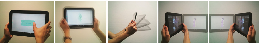
Fig. 3. Example user interactions from left to right: tap, shake, pitch, turn left & turn right

MockAR engages non-programmers in the UI design process of AR interactions, making this task accessible to a wider group of creators used to wireframing. MockAR emulates AR effects by displaying a linear order of semi-transparent images in front of camera-captured video. It makes full use of available sensors of mobile devices as input options to advance the image sequence. The image succession is determined by alphabetical order of image file names (0–9, A–Z). Transition between two images is set by an interaction keyword (e.g. shake , pitch , turnL , turnR , tap ) contained in the last six letters of the file name. In SPIRIT, we used MockAR with interactions like tapping on screen (default), shaking, pitching by 90°, turning the device left and right (Fig. 3), and setting a timer. A six digit number sets timed image transitions in milliseconds. Technical skills needed for using MockAR are image editing, changing filenames, saving files on an Android device and installing and starting the Android app on a mobile device. Therefore we assume MockAR is easy to use for non-programming user interaction designers.