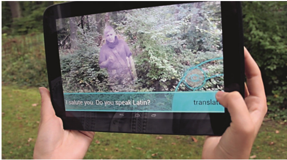
Fig. 1. Early functional prototype of the SPIRIT application

afforded several stages of prototyping before the system's full implementation [1]. Easy prototyping of location-based AR experiences requires tools that go beyond existing approaches. As a side result in the SPIRIT research project, we developed the AR UI prototyping tool MockAR for the project's non-programming designers. It supports the widely known principle of 'wire framing', used to draft and test so-called click dummies in early development stages [9]. MockAR plays back image sequences that can be experienced based on a wide range of user interactions using handheld devices' sensors.